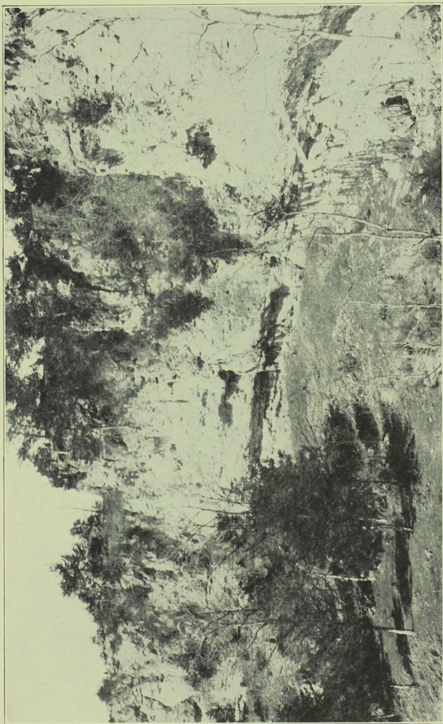
AN ANCIENT ROCK SHELTER THREE MILES EAST OF MONTICELLO, IOWA