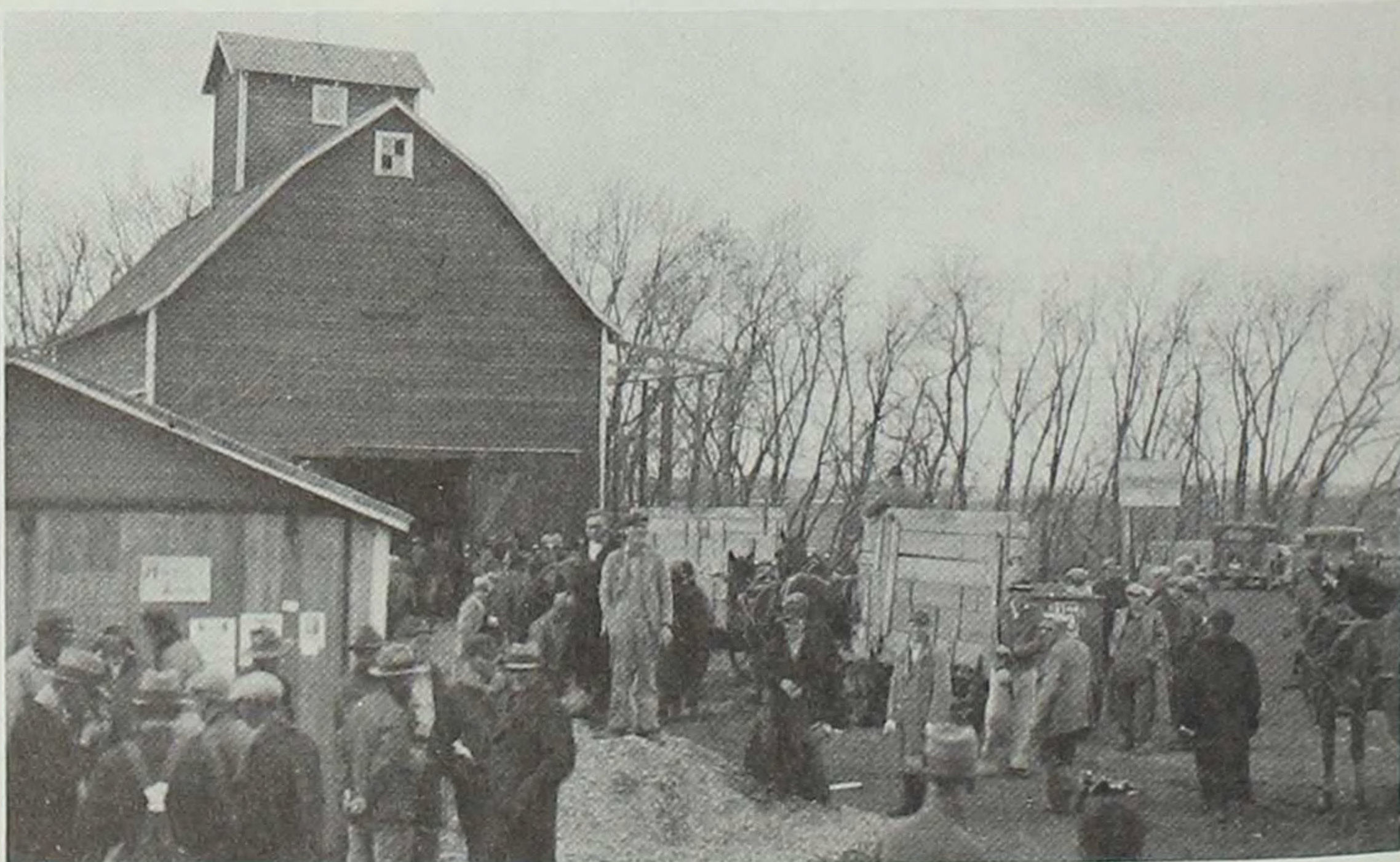
Corn huskers and spectators return from the field and await the final results, possibly on the occasion of the 1926 Iowa meet.