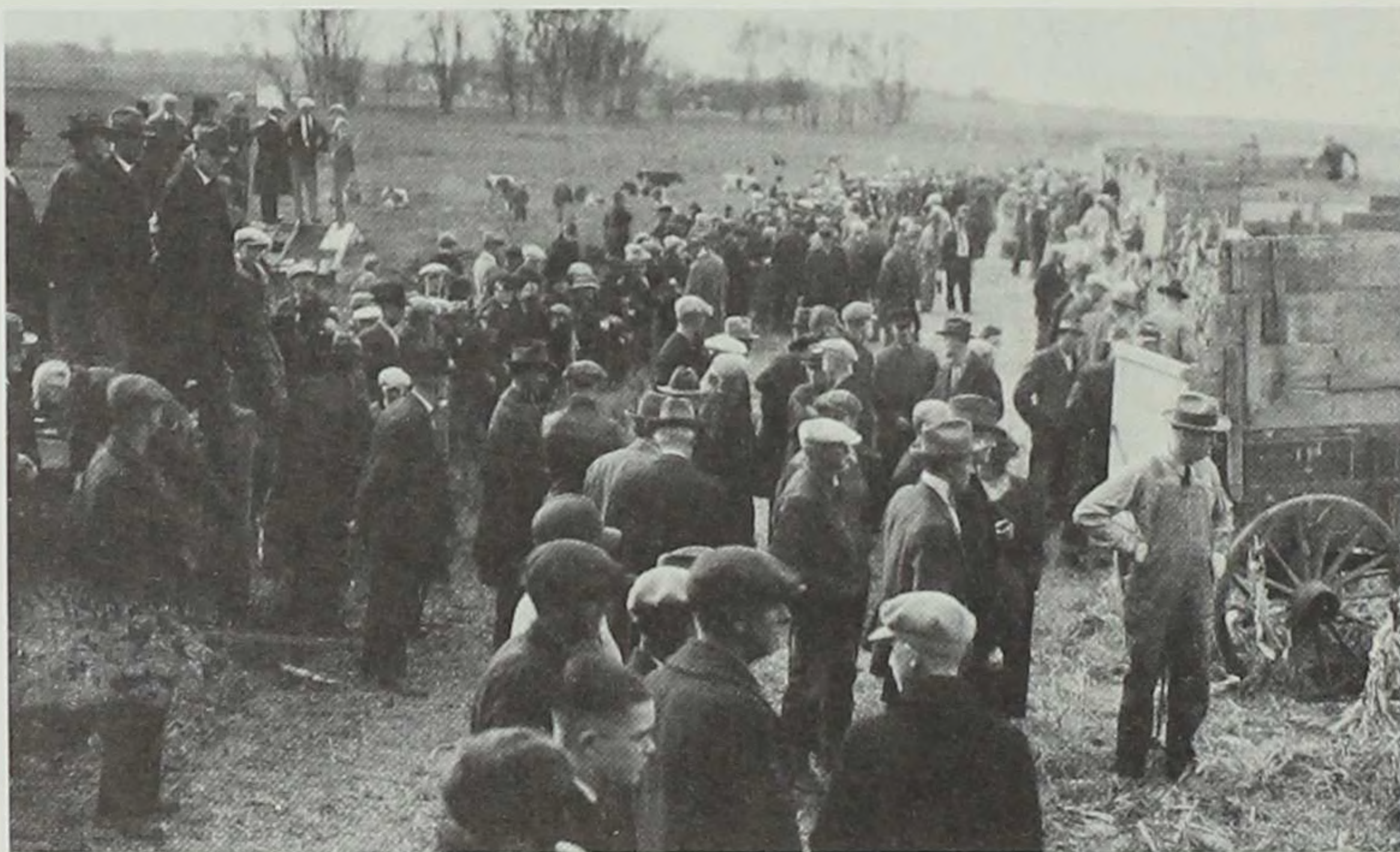
The contestants and crowd ready for the start of the 1926 Linn County corn husking contest, held at Marion, Iowa.

making "economic heroes" out of men who increased production spectacularly. "What most of us want more than anything else," Wallace assumed, "is to stand well in the eyes of the community, and it is fitting that those men who contribute most to the community's welfare should gain the most prestige." Thus, he proposed that the United States should recognize economic heroes. Aware that men such as Edison and Ford had already achieved such status, he wanted to recognize "men who have added greatly to the productive power of the community by doing things unusually well with their hands," such as husking over 130 bushels in a day. "We in the United States are