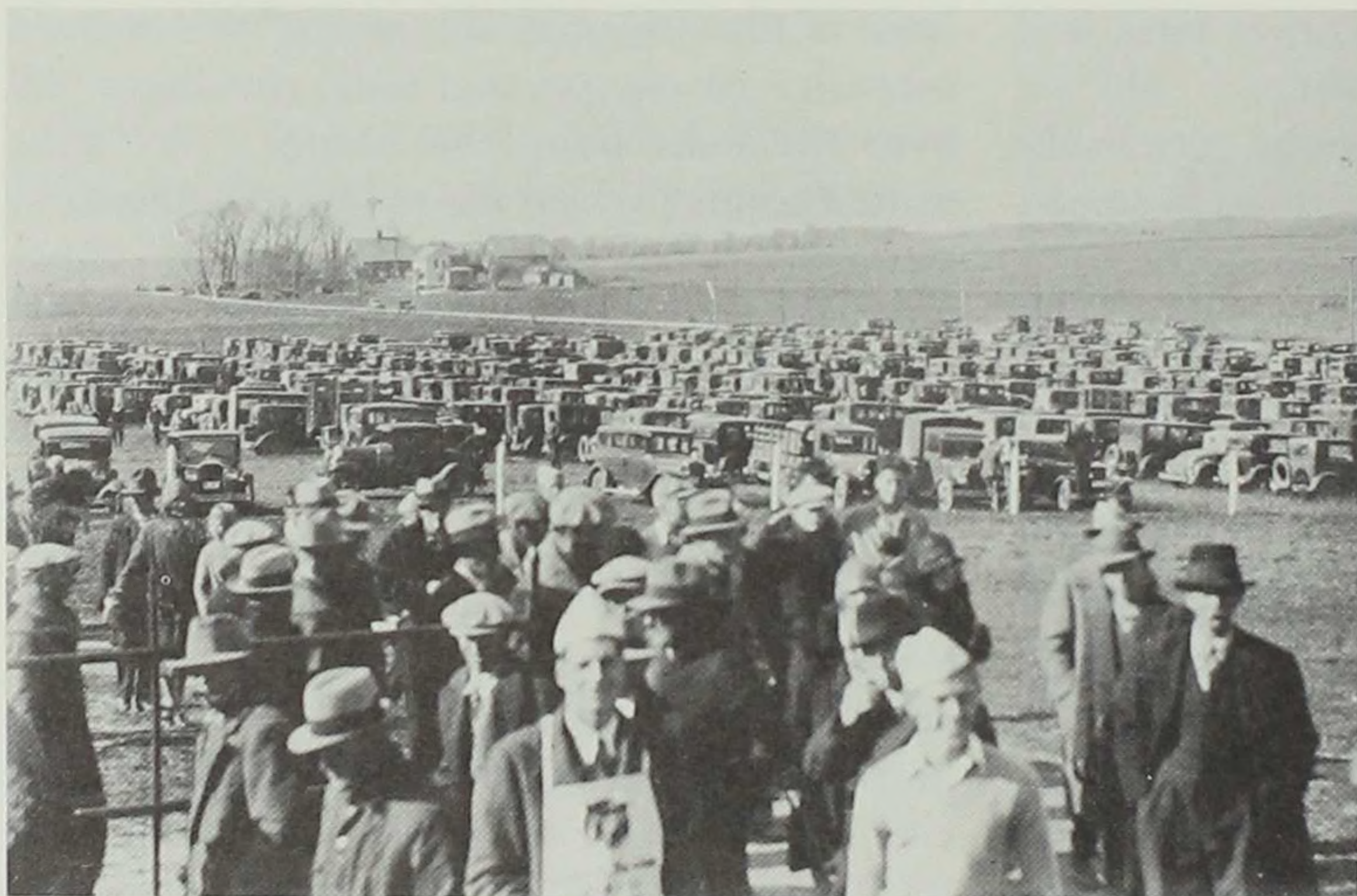
By the late 1920s and early 1930s thousands of spectators showed up for corn husking contests. The crowd for the 1931 Iowa state championship meet is suggestive of the high level of spectator interest. The 1931 national meet, also held in Iowa, attracted 60,000 spectators.