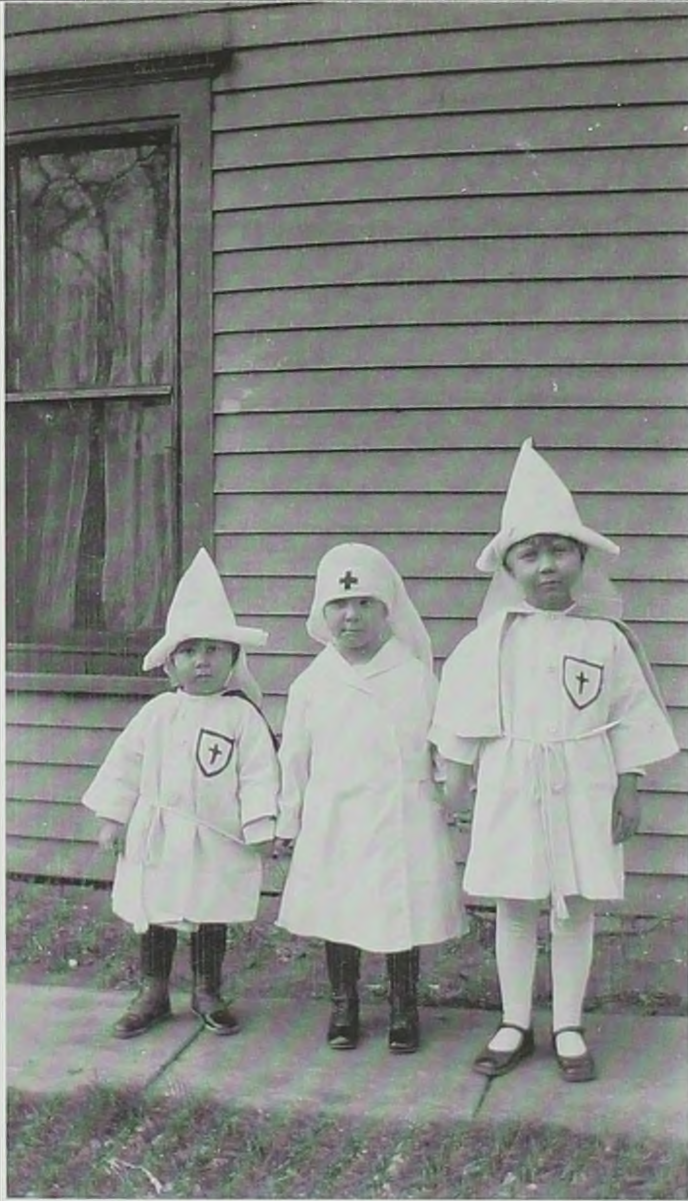
Child-size robes were also available. As in other women's clubs, Klanswomen sometimes took on charity work, such as wrapping bandages. The middle child's nurse's outfit may reflect such an activity.

America became more industrialized and American government and businesses more bureaucratized.