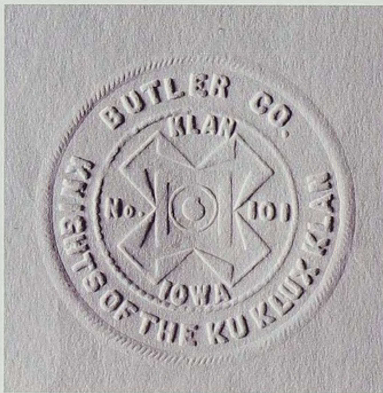
Embosser from klavern No. 101 in Butler County creates this raised symbol on paper.

cans who were angered by abstract changes in society's mores and power structure, and saw the Klan as one way of regaining that control, if only locally. First, consider the episode over the Knut Hamsun novel. Klansmen on the Argyle school board apparently considered the Hamsun novel an affront to the moral values of the community. There is also the suggestion that there was discontent with how the town leaders, as represented by the main street businessmen, ran Argyle. In the Klan's efforts to "gain influence" the Klan might have been expressing dissatisfaction with a business leadership that perhaps was