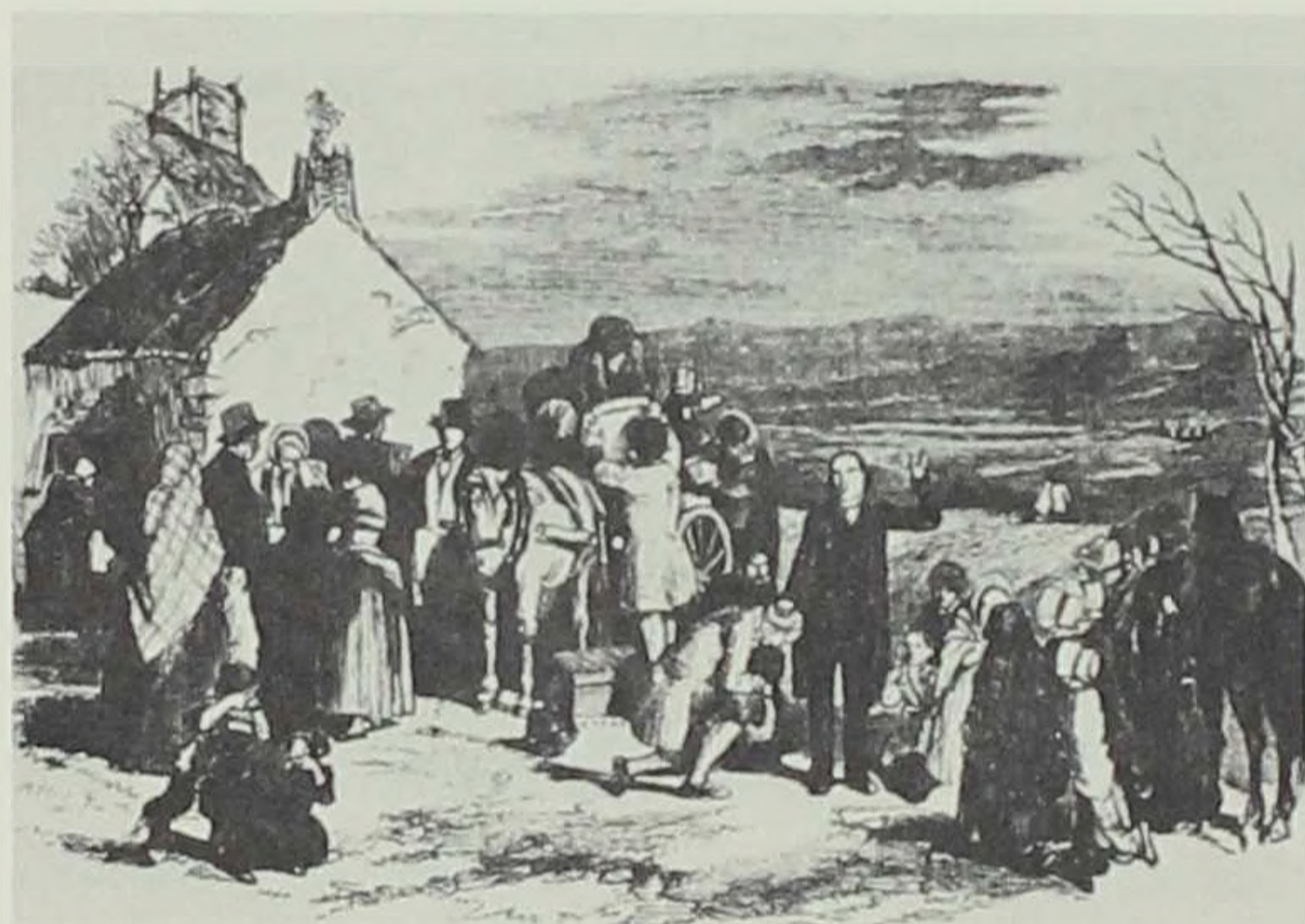
An Irish priest blesses parishioners bound for the New World, from the Illustrated London News, May 10, 1851

United States. Knowledge of Brennan's varied activities, no matter how suggestive, enabled O'Connell to conclude that Brennan was not in a Fenian ring. He wrote to his superior in the surveillance organization: