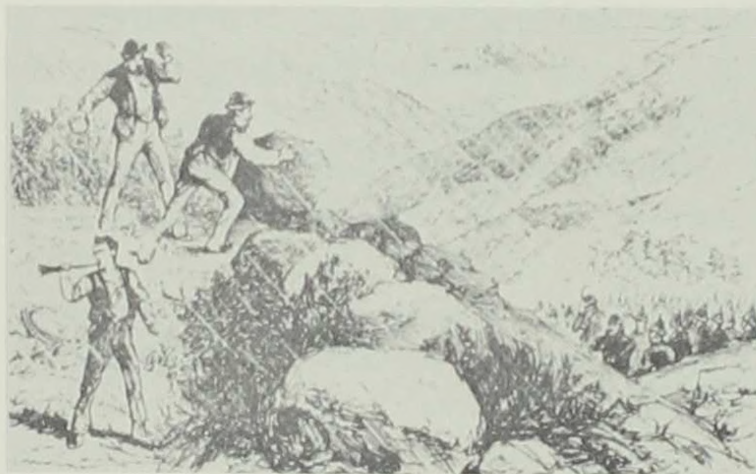
An Irish rent war, as depicted in the Illustrated London News, January 29, 1887

reported that the Canadian government, frightened by Fenian scares since January, had adopted tighter security measures along the border between the United States and Canada. As in the 1860s, the Canadians requested that the United States increase its vigilance along the border.