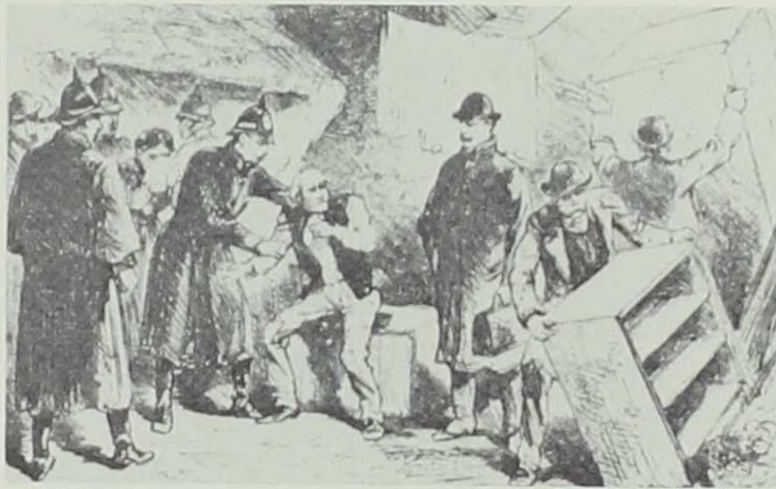
An eviction in County Kerry, from the Illustrated London News, January 29, 1887