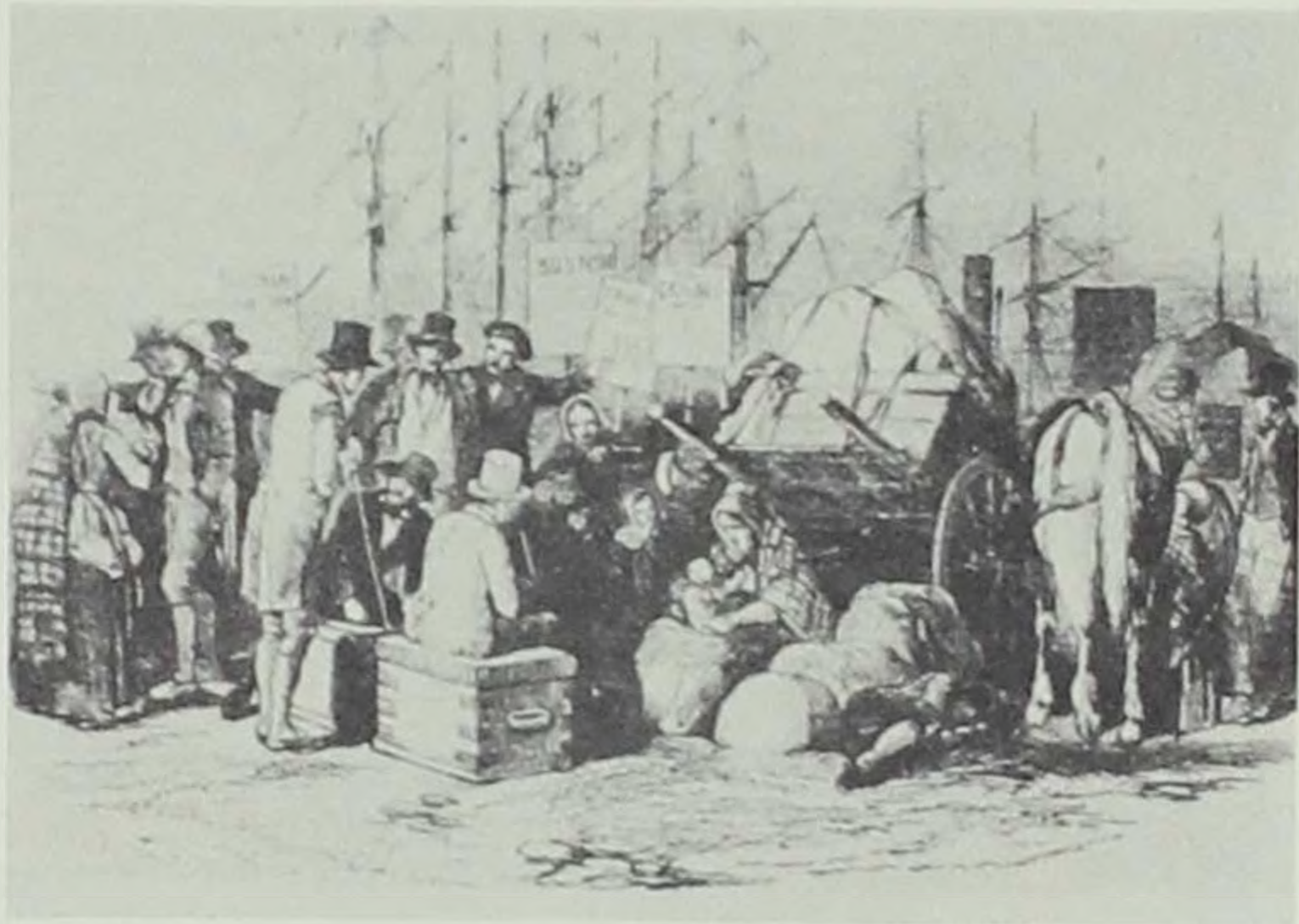
Emigrants about to set sail from Ireland to America, from the Illustrated London News, May 10, 1851