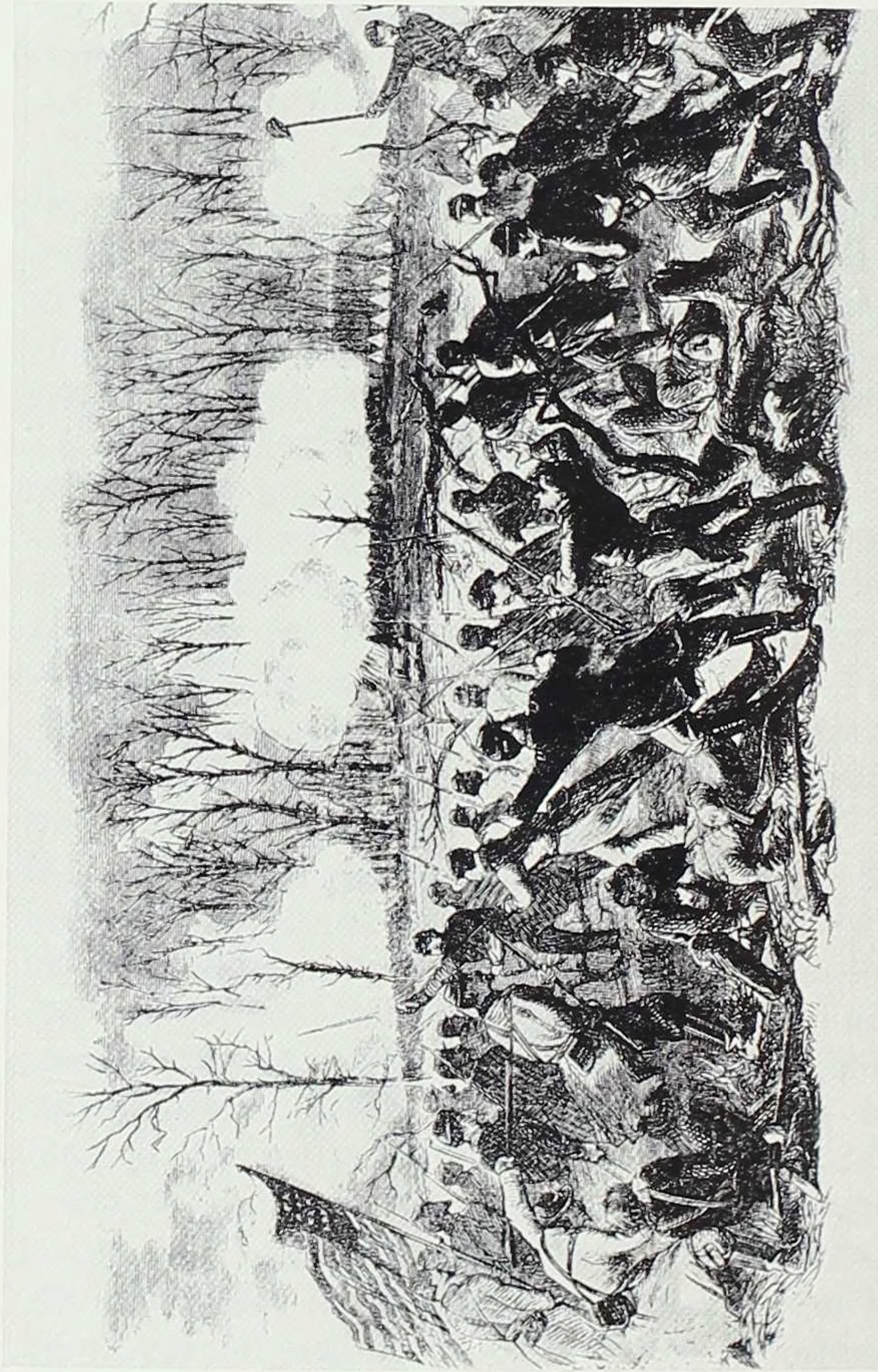
Harper's Weekly , March 15, 1862. Attack of Second Iowa on Batteries of Fort Donelson