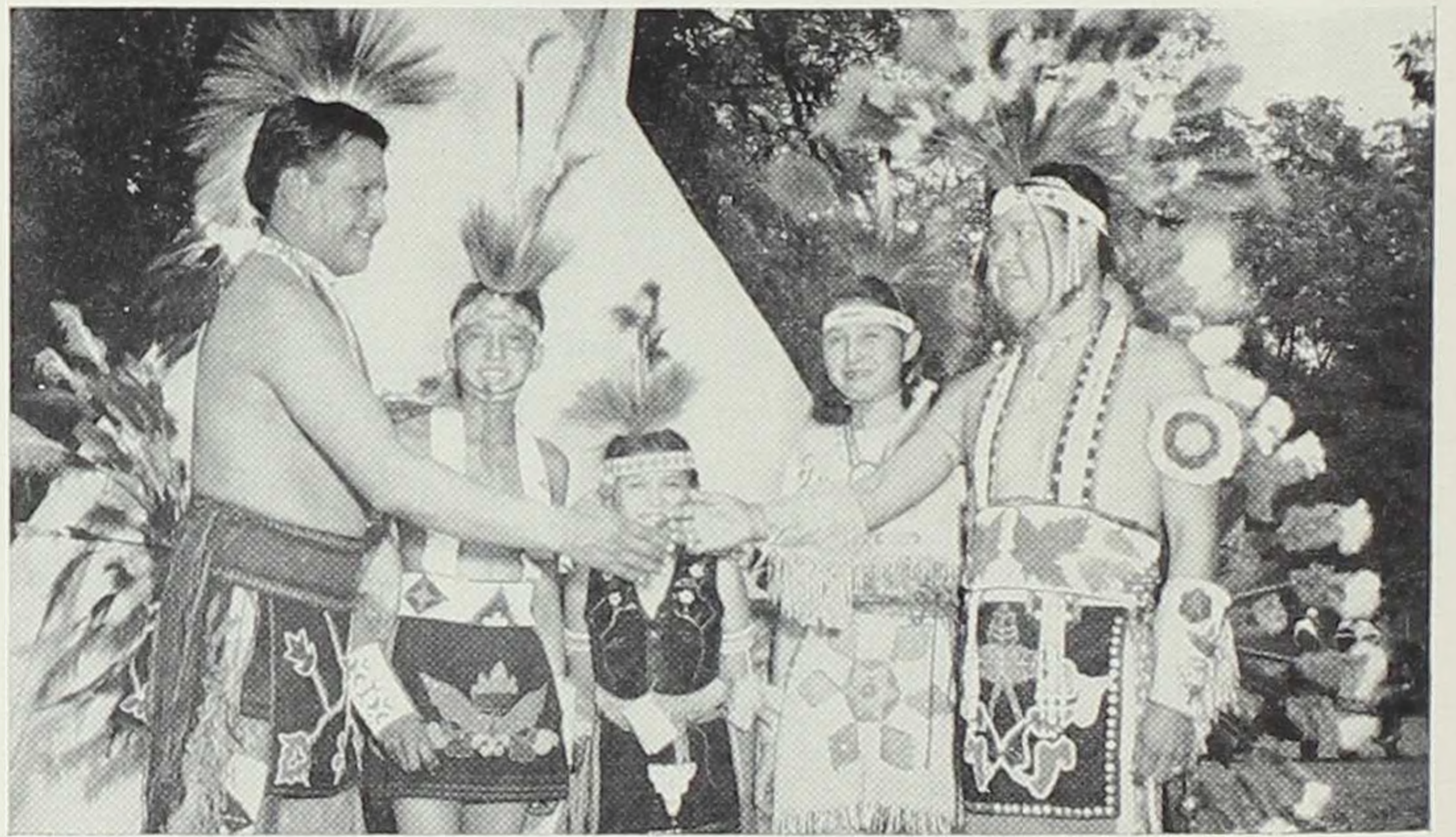
Oklahoma Tribesman Welcomed at Tama Powwow.