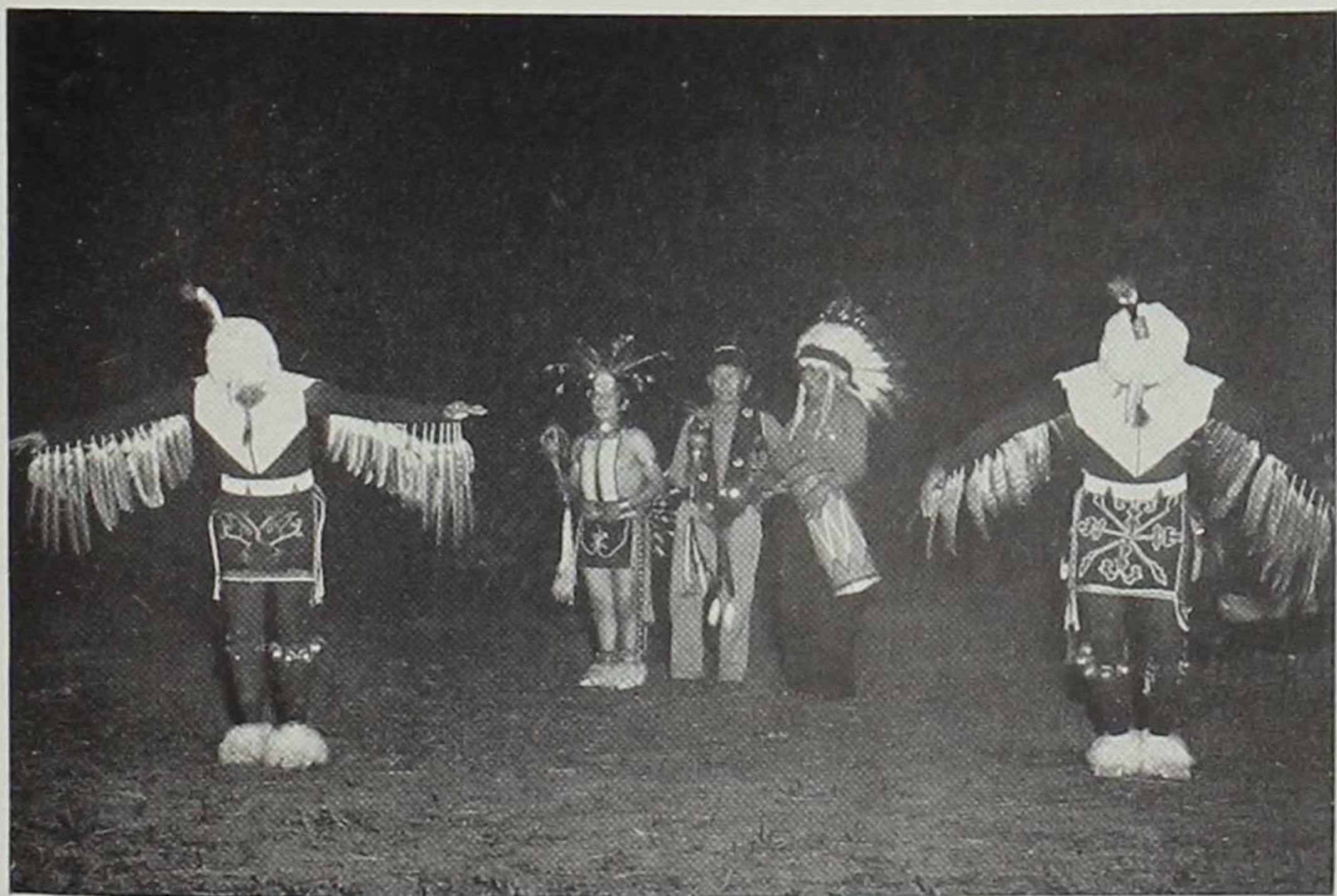
Eagle Dance Borrowed From Southwestern Indians.