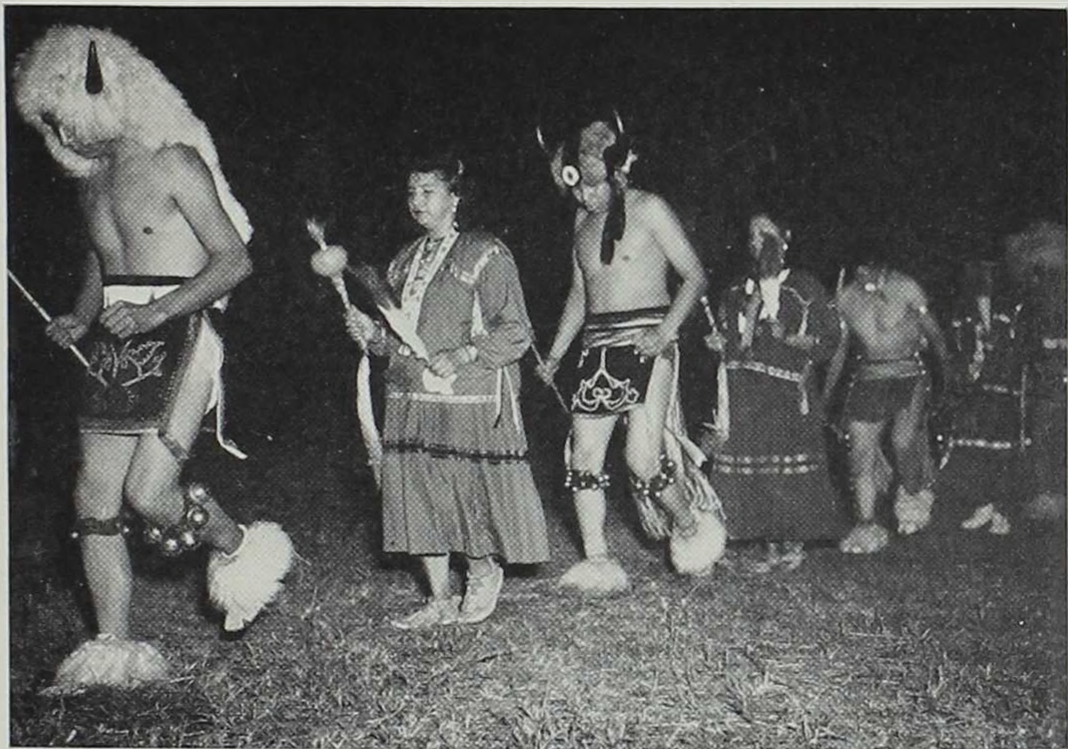
Buffalo Dance Tells Story of Successful Hunt.