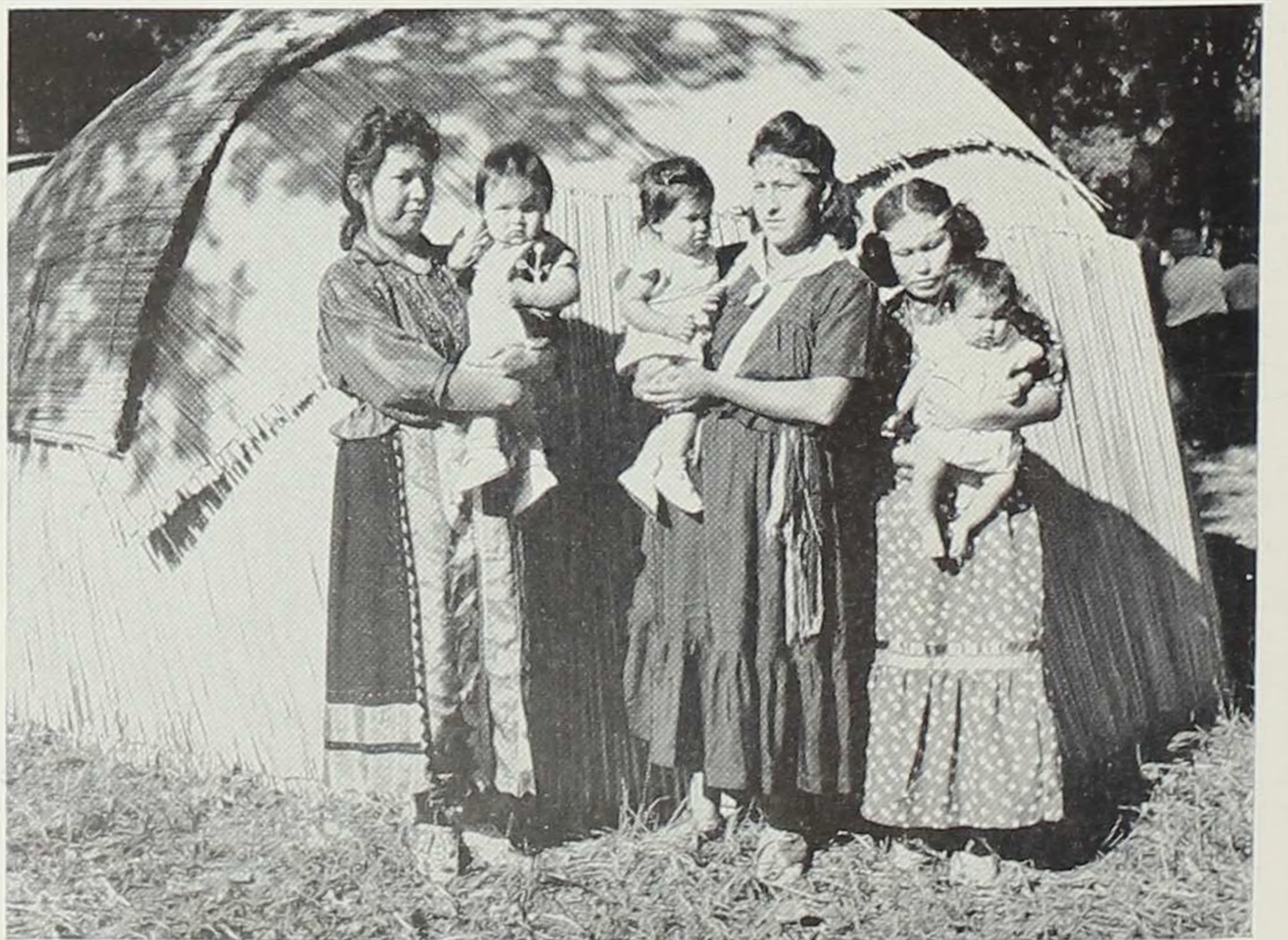
Indian Mothers Exhibit Prize-Winning Babies.