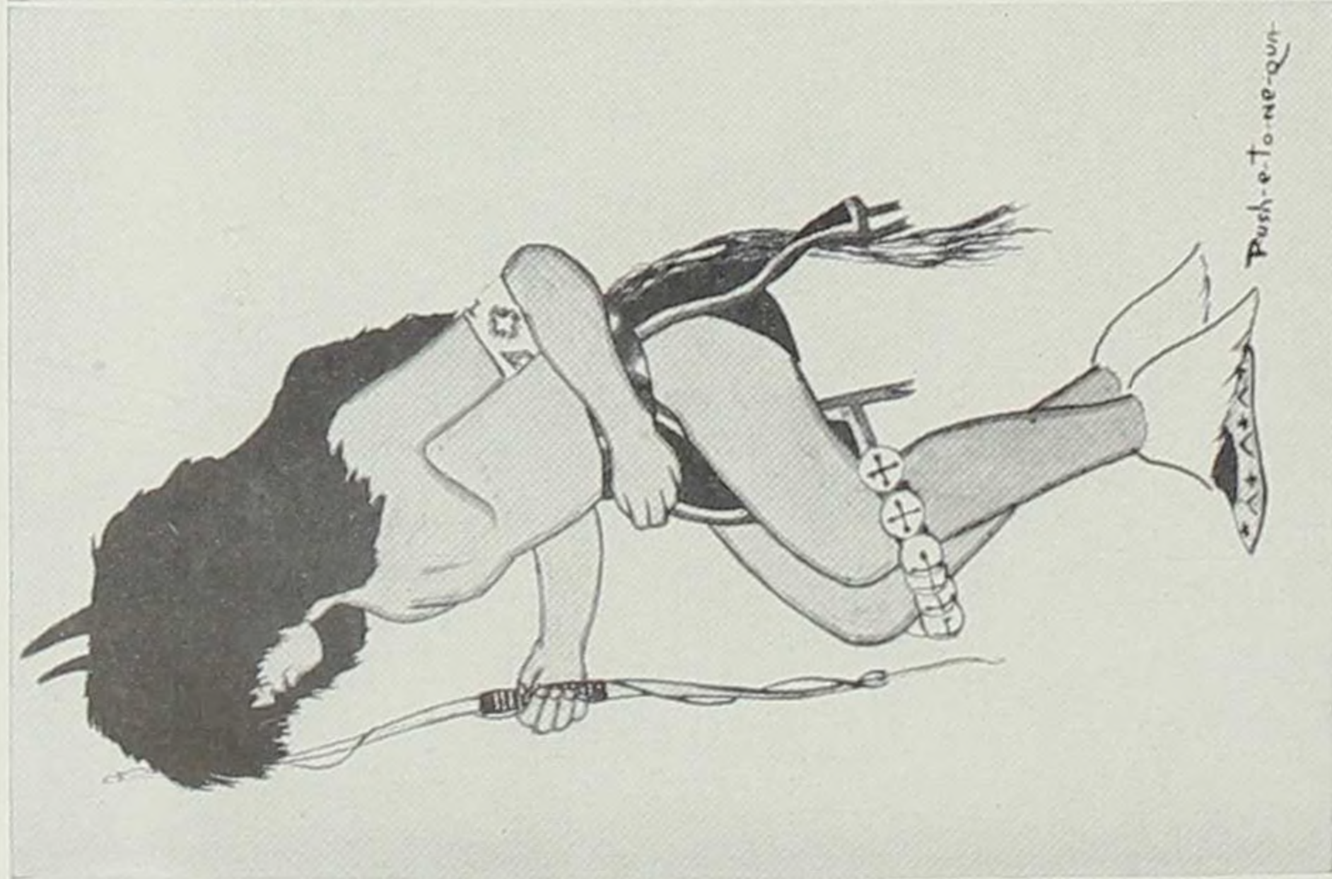
The Buffalo Dance