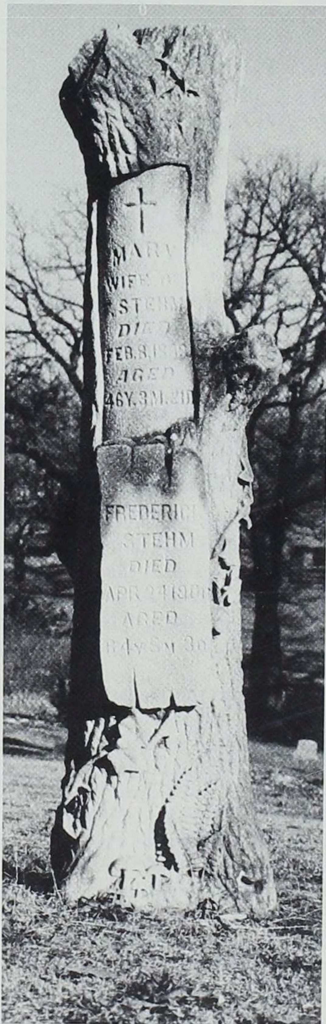
Typically, a section of "bark" appears to have been peeled back, leaving space for carving.