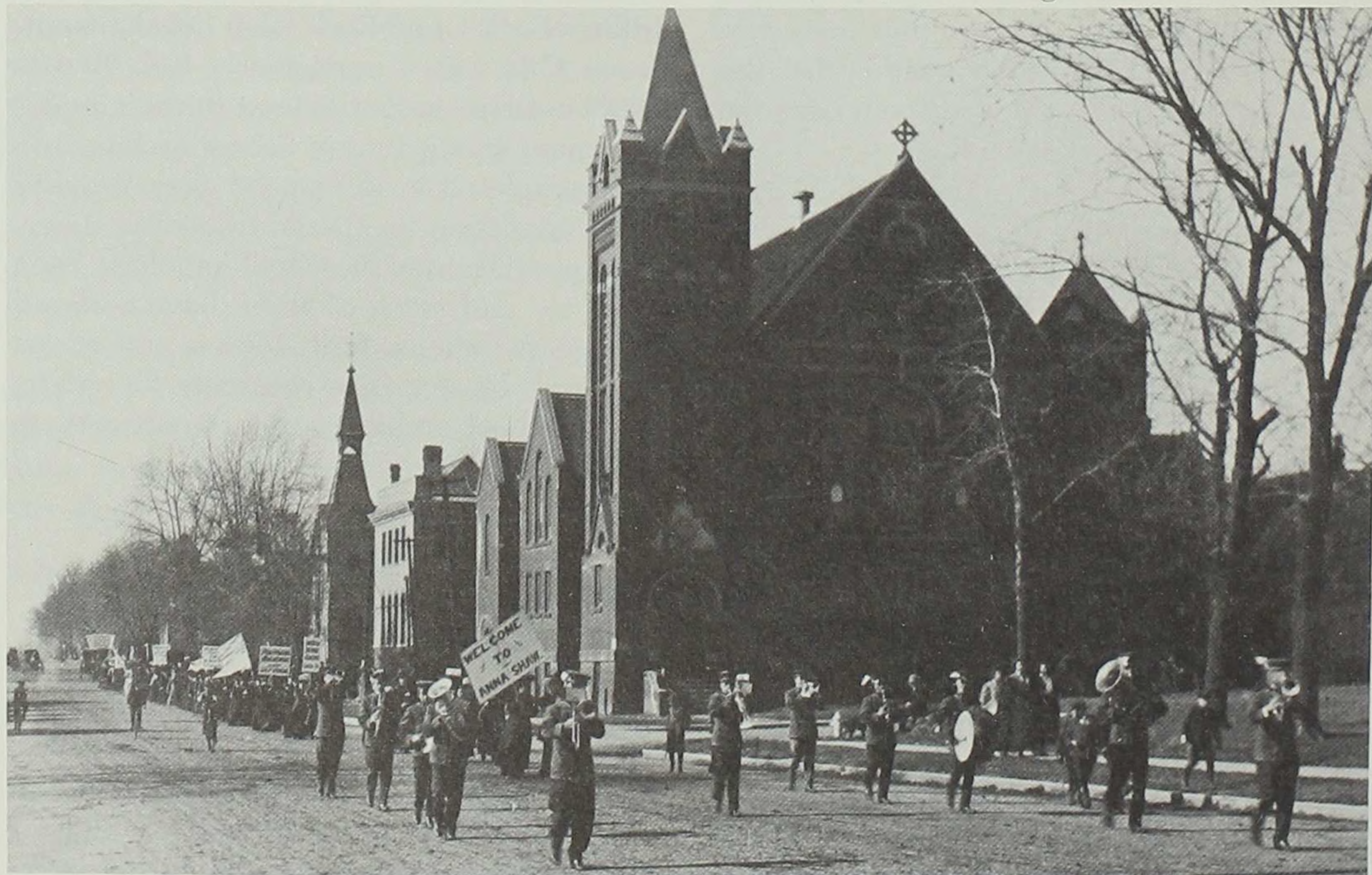
A 1908 parade in Boone, Iowa, in support of woman suffrage. (ISHD, Des Moines)

© Iowa State Historical Department/Office of the State Historical Society 1984 0031—0360/84/0506—0106 $1.00