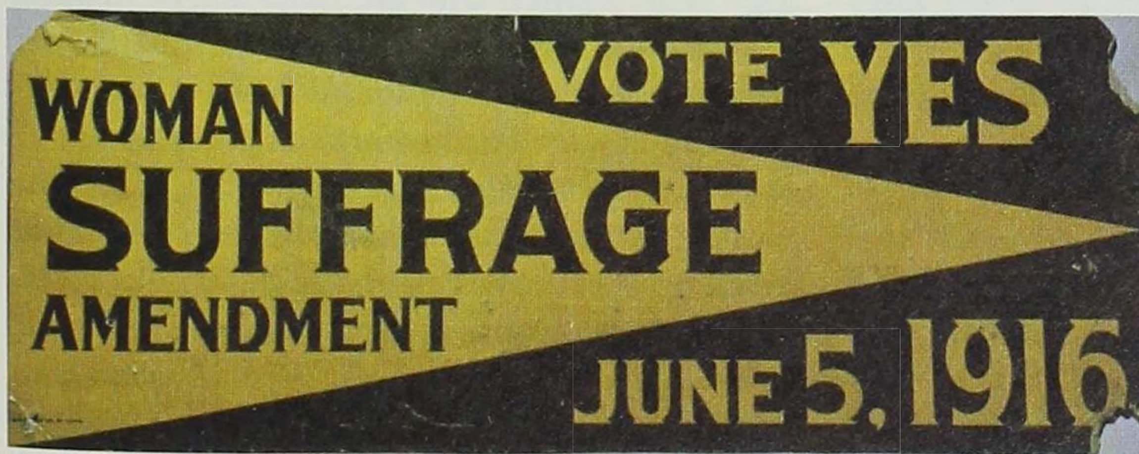
This well-used sign urged Iowa voters to approve the woman suffrage amendment to the Iowa constitution at the polls on June 5, 1916.

Yet the 1916 Iowa Equal Suffrage Association convention, held in Des Moines between