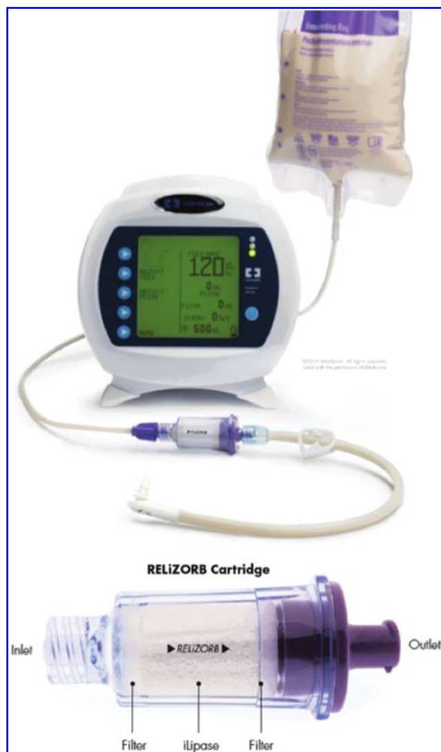
FIG. 1. Enteral feeding system and detail of RELiZORB enzyme cartridge.

acid plasma levels significantly below those of healthy individuals despite receiving EN for a mean 6.6 years. Results showed that use of the cartridge resulted in a statistically significant 2.8-fold increase in fat absorption vs. placebo, fewer reported GI events irrespective of PERT use, and improved tolerability vs. baseline (Figure 2). Investigators reported that use of the cartridge was associated with a 57% reduction in the incidence of diarrhea. In addition, more participants reported preservation of appetite and breakfast consumption when using the digestive cartridge compared with their pre-study regimens. This likely was because of an increase in fat absorption from EN and an associated decrease in the frequency and severity of symptoms of malabsorption.