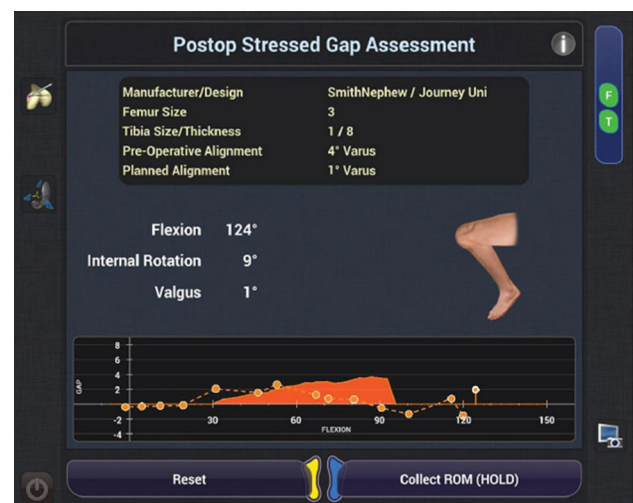
Fig. 5 Post-operative gap assessment under stress throughout a range of flexion

Overall survivorship of the knee implant in these robotic-assisted cases at 2 years (96 weeks) was 99.2% (95% confidence interval 94.6–99.9%), which was non-inferior when compared to the reference survival rate of 95.7% from the