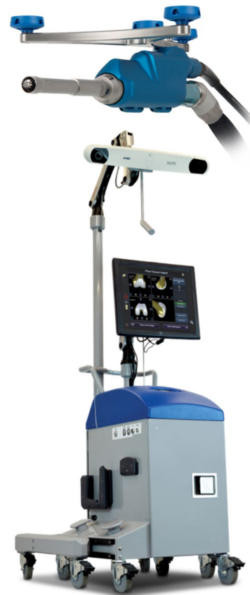
Fig. 1 The NAVIO surgical system and handpiece

The NAVIO system consists of several components (Fig. 1). A tracking system and stand uses infrared cameras to