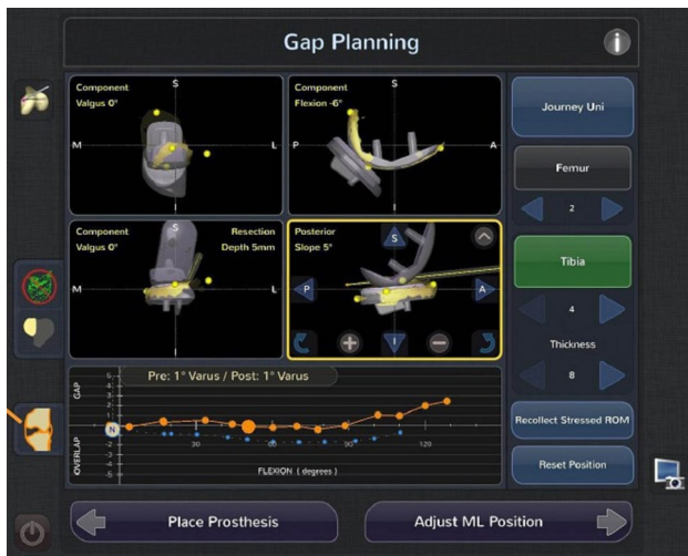
Fig. 3 Planning screen to show predicted gaps throughout a range of flexion

reaches the edge of the cut planes. For the UKA application, the NAVIO system is used to prepare all of the bony surfaces including the tibial and femoral planar surfaces and peg holes (Fig. 4).