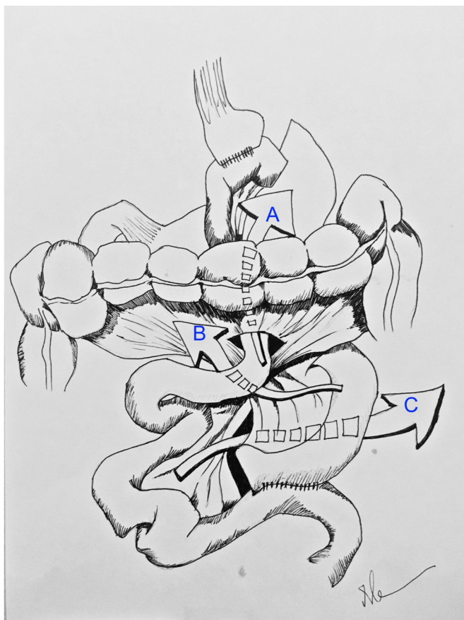
Figure 2 Internal hernias of retrocolic Roux-en-Y gastric bypass. (A) Transverse mesocolic defect. (B) Petersen's defect. (C) Jejunojunostomy mesenteric defect.

endoscopy or abdominal ultrasounds and potentially delaying therapy. 55–56 Cross-sectional imaging may reveal telltale signs of internal hernia, such as mesenteric swirl or obstructive patterns and engorged mesenteric nodes. 57 However, CT imaging has a suboptimal sensitivity for internal hernias in patients with a history of bariatric operation and may be read as normal in up to 30% of patients. 54