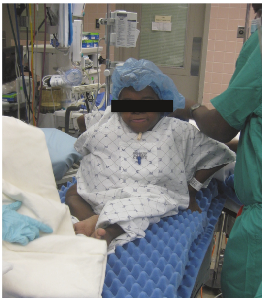
Figure 4. The external appearance of the patient with type III osteogenesis imperfecta.