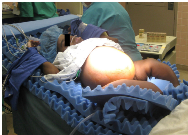
Figure 6. Patient positioning and padding at time of cesarean delivery.