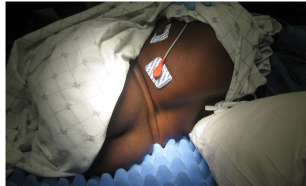
Figure 3. Severe kyphoscoliosis.

She initially presented at 8 weeks' gestation for prenatal care when she was 23 years old. Her height, weight, and body mass index (BMI kg/m 2 ) were 96 cm, 25 kg, and 27.1 kg/m 2 , respectively (Fig. 4). She had a mediport placed the year prior due to a prolonged hospital course secondary to pneumonia and difficulty swallowing tablets. On physical examination, she was noted to be very short stature. She measured 17 cm from her iliac crest to her