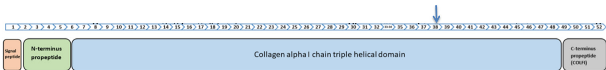
Figure 1. Diagram of the COL1A1 exons. The blue arrow points to the mutation our patient had in one allele of the COL1A1 gene (c.2596G>A) at exon 38.