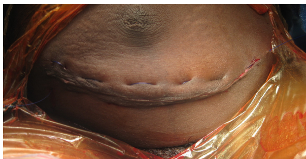
Figure 7. Infra-umbilical skin incision.