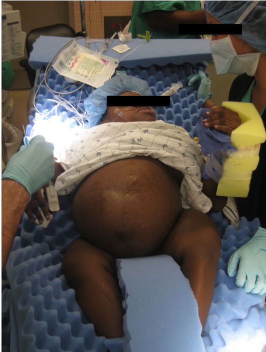
Figure 2. Severe anterior bowing of tibiae.

restrictive lung disease due to severe kyphoscoliosis (Fig. 3) with associated chest wall deformities and severe asthma. She has had multiple admissions during her lifetime for recurrent pneumonia. Her longtime steroid use (Prednisone 10 mg daily) for lung disease caused her to suffer from steroid induced diabetes mellitus. Maternal-fetal medicine physicians followed both of her pregnancies.