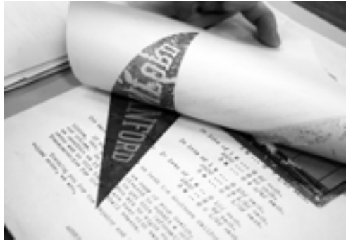
Figure 3. Decal stuck to a paper document, damage that is difficult or impossible to reverse. Forrest Allen Papers, 66/11, Kenneth Spencer Research Library, University of Kansas.

periods of time (Weiss 1935: 9). In overly wet conditions, on the other hand, unapplied decals could stick together. Often decals were separated by slip sheets to prevent this (Biegeleisen and Busenbark 1941: 154). In general, decals will not stick if the relative humidity and temperature are maintained at accepted museum storage levels (circa 70 degrees Fahrenheit and 50 percent relative humidity). However, if a decal should stick to a nearby item, such as a paper document as seen in Figure 3, it will be difficult or impossible to remove without destroying the decal image and possibly also the substrate.