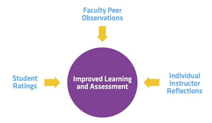
FIGURE 3. Three "voices" in a scholarly framework for assessing teaching.

These framework categories are held constant across all departments; however, specific interpretation of the components of the framework and their relative weights are defined at a department level (Figure 3). Thus, departments specify in a clear way what is meant by "multiple measures" and "significant results" locally, but use common categories across the campus.