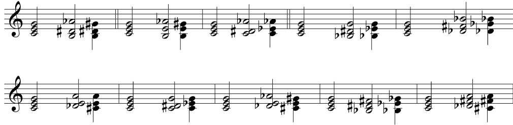
Example 6. Contradictions between diatonic harmony and diatonic idealized voice leading in ten non-equivalent progressions