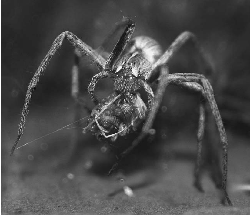
PLATE 1. Predator-prey interaction between the lycosid spider Pisaura mirabilis and the cricket Gryllus assimilis .