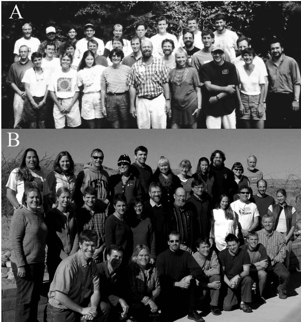
Figure 3. A.—Preliminary group of collaborators at Coweeta Hydrologic Laboratory in 1995 that led to formation of the LINX I group. B.—Lotic Intersite Nitrogen eXperiments (LINX) II collaborators at a synthesis workshop at the Sevilleta long-term ecological research site (LTER) near the end of the experiment in November 2006.

proach, which included whole-stream ^{15}\text{N} -tracer experiments bolstered by other ecosystem measurements, a cross-site comparative design, and integration of modeling and empirical approaches, also added to its appeal.