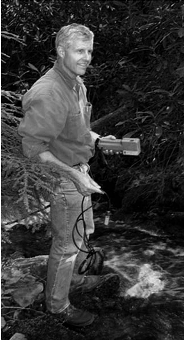
Figure 1. Patrick J. Mulholland (1952–2012), leader of the Lotic Intersite Nitrogen eXperiments (LINX).

physical data set (Zhang et al. 1999, Hubbard et al. 2013) through collaboration across the disciplines of hydrology, ecology, geography, and modeling. Collaboration between ecophysicists and hydrologists addressed the fate of water use by vegetation (Brooks et al. 2009). A large cross-continent experiment on terrestrial nutrient enrichment (NUTNET) has provided broad and general results (Borer et al. 2014). Like LINX, these studies were able to address large-scale scientific questions by applying disciplinary expertise to interdisciplinary problems through focused collaborative effort.