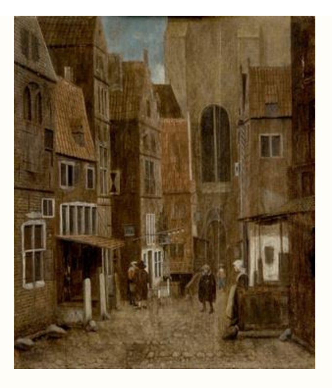
Figure 3. Jacobus Vrel, Street , ca. 1650, oil on panel, 48.9 x 41.9 cm. Philadelphia Museum of Art, John G. Johnson Collection, 1917, inv. no. 542. (artwork in the public domain)

By around 1650 Vrel began to paint some of the first, if not the first, close-up views