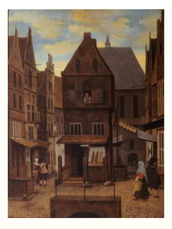
Figure 5. Jacobus Vrel, Street Scene , ca. 1654–62, oil on panel, 52.5 x 79 cm. Hartford, Conn., Wadsworth Atheneum, The Ella Gallup Sumner and Mary Catlin Sumner Collection Fund, inv. no. 1937.489. Photo: Wadsworth Atheneum Museum of Art/Art Resource, NY (artwork in the public domain)

Along the pathways, before shop fronts, and on stoops, neatly dressed figures singly or with a companion(s)—walk, stand, or sit with relaxed, but respectable body language; attend to a shop's outdoor display of goods; pause to chat; rest leisurely on a bench; carry a marketing pail; lean against a shop front; or casually peruse the street scene below from an open window. In two paintings (figs. 2, 6), a few chickens in the figures' midst forage among the cobblestones. In short, the paintings convey an aura of equanimity and tranquility in which the figures occupy a neighborhood's tidy street in prototypically prescribed ways.