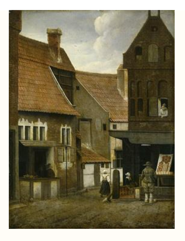
Figure 4. Jacobus Vrel, Street Scene , oil on oak panel, 50 x 38.5 cm. Hamburg, Kunsthalle, inv. no. 228. (artwork in the public domain)

All of the paintings focus on the exemplary appearance and atmosphere of a neighborhood's short streets, alleys, and buildings. Narrow, crisscrossing passageways define the zigzag of rows of well-kept gabled houses, which flank either side of the road. In seven of Vrel's scenes, the ground floor of the buildings includes a shop, such as for baked goods, cloth, or vegetables,<sup>12</sup> or an attached stall (figs. 2–6).<sup>13</sup> A tiled or wooden overhang, which extends above most front doors, protects the outside goods for sale. Two of Vrel's paintings (figs. 2, 5) also include a street vendor at a doorway, who offers goods from his satchel. Shop signs project from exterior walls of the houses in six of the paintings (figs. 1–3, 5).<sup>14</sup>