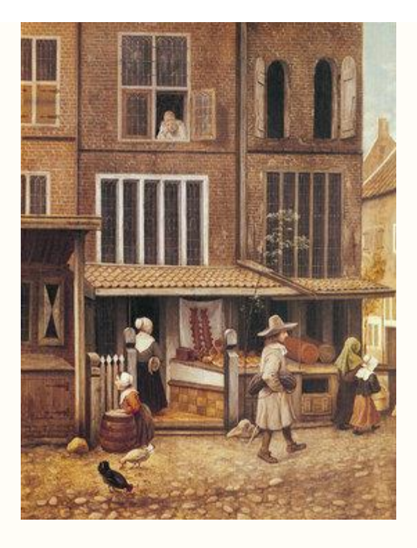
Figure 6. Jacobus Vrel, Corner of a Town with a Bakery , oil on panel, 35 x 28 cm. Private collection, New York. Photo: Private Collection/Giraudon/The Bridgeman Art Library (artwork in the public domain)

Together the angled juxtaposition and overlap of the variously sized planes of color formed by the brown-red brick buildings, the white window and door sashes, the brown or black-and-white shutters, the yellow-orange tiles on shop overhangs, and the different hues of the projecting shop signs create syncopated compositional rhythms that suggest the twists and turns, nooks and crannies, and tight quarters of the site. Here and there the blue or bright red hue of the upper garments worn by some of the figures contributes an additional pop of color to the visual rhythm of the compositions. Above the buildings or peeking in-between them in all but one of Vrel's paintings (fig. 7), blue skies streaked with bits of clouds provide the cool-color complement to the warm hues and values of the street and buildings below.