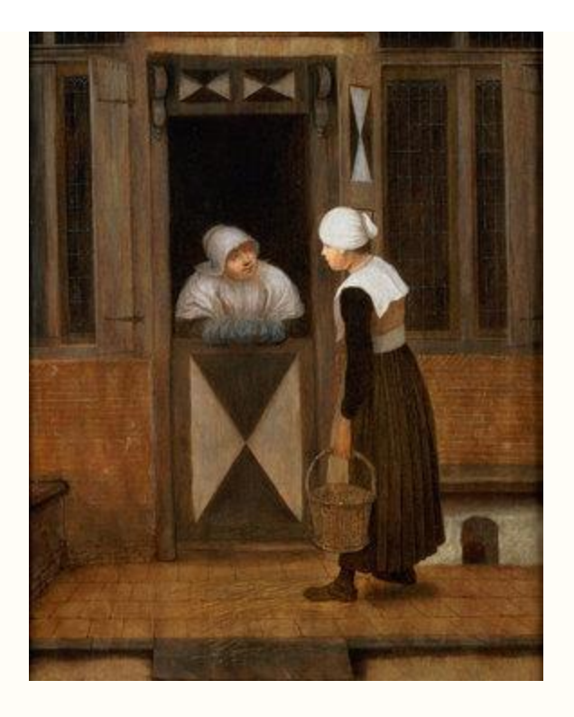
Figure 7. Jacobus Vrel, A Conversation in the Street , ca. 1654–62, oil on panel, 35.6 x 27.9 cm. Private collection. (artwork in the public domain)

The slightly elevated angle of view of the paintings' beholder, together with the proximity of the pictured scenes, position one as though peering onto the sites from a window or open door of a house parallel to the depicted streets. As such, the paintings' framed picture planes function as the fictive window or doorframe through which the viewer observes the scenes. The beholder's implied spatial position and the act of viewing find their mirrored parallel in Vrel's half-length figures, who peer out of windows in four of the paintings (figs. 4-6)<sup>15</sup> and over a half-open Dutch door in another scene (fig. 7).