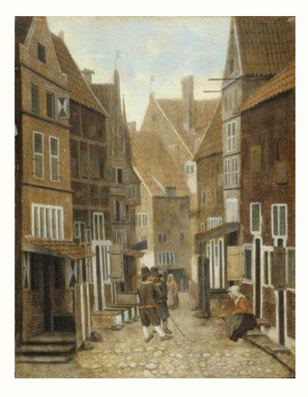
Figure 1. Jacobus Vrel, City View , ca. 1654–62, oil on panel, 36 x 28 cm. Amsterdam, Rijksmuseum, inv. no. SK-A-1592 (artwork in the public domain)

Scholars have identified Jacobus Vrel's mid-seventeenth-century paintings of close-up urban views as cityscapes, townscapes, street scenes, street views, or streetscapes (figs. 1–7). However, this study posits a more specific historical framework in which to contextualize the pictures. Vrel's paintings pictorially engage the intimate physical parameters and ambiance of the Dutch neighborhood, rather than city or town, with close-up renderings of the signifiers of such small communities: part of a street, a short lane, a row of houses, shops, passersby, and quotidian activities.<sup>1</sup>