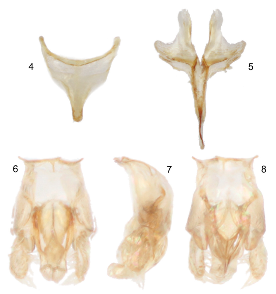
Figures 4–8. Male terminalia of Chiasmognathus scythicus , new species. 4. Seventh metasomal sternum. 5. Eighth metasomal sternum. 6. Genital capsule, ventral view. 7. Genital capsule, lateral view. 8. Genital capsule, dorsal view.

ginal cell broadly truncate; both m-cu crossveins entering second submarginal cell. Terminalia as depicted in figures 4–8.