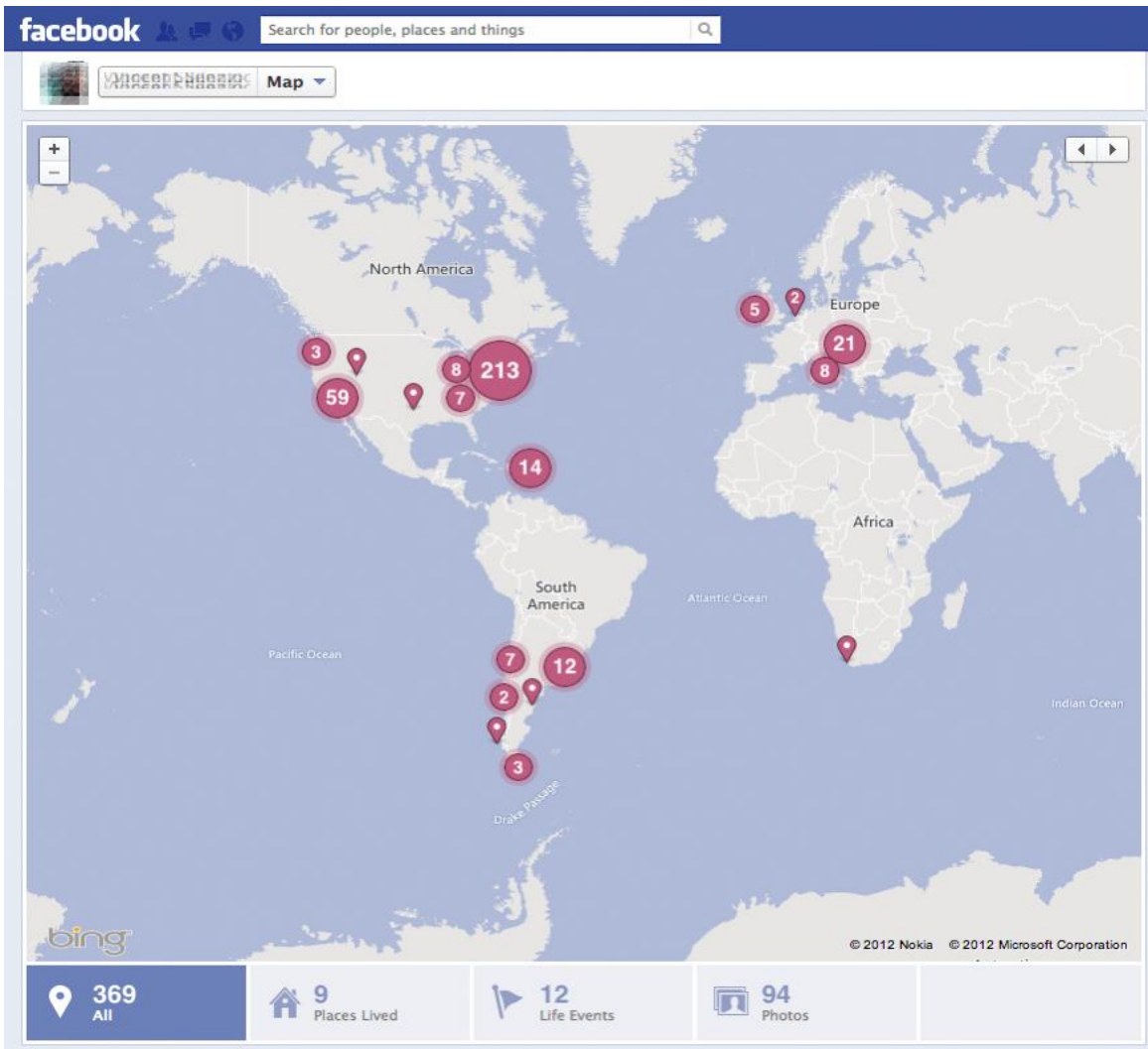
Figure 2: A user profile map on Facebook