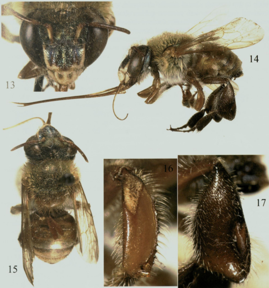
Figs 13-17: Euglossa (Euglossella) urarina sp. n., male holotype. – 13 facial aspect. – 14 lateral habitus. – 15 dorsal habitus. – 16 outer surface of mesotibia. – 17 outer surface of metatibia.

Coloration. Head mainly metallic dark green (except as described below), with bronzy-golden highlights specially on interantennal area and antennal depressions; clypeal ridges and edges brown, brown on anterior half of vertex and narrow genal streak bordering compound eye; paraocular ivory marks as in E. cosmodora , except lower width equals three quarters of length of lower lateral parts of clypeus; lower lateral parts of clypeus, labrum, malar area and mandibles as in E. cosmodora ; antenna brown; scape with ivory spot covering most of anterior surface (Fig. 13). Most of mesosoma metallic green with strong bronzy highlights (particularly on center of mesoscutum); anterior half of prothorax and anterior flattened sections of mesepisternum brown; posterior two thirds of mesoscutellum amber (Figs 14-15); legs brown, yellow-amber on two proximal podites; pretarsal claws slightly lighter, distal half dark brown; faint bronzy-green highlights on all legs specially on proximal podites (Figs 14, 16-17). First metasomal tergum amber-yellow mesally, lateral edges and posterior narrow streak brown; second metasomal tergum