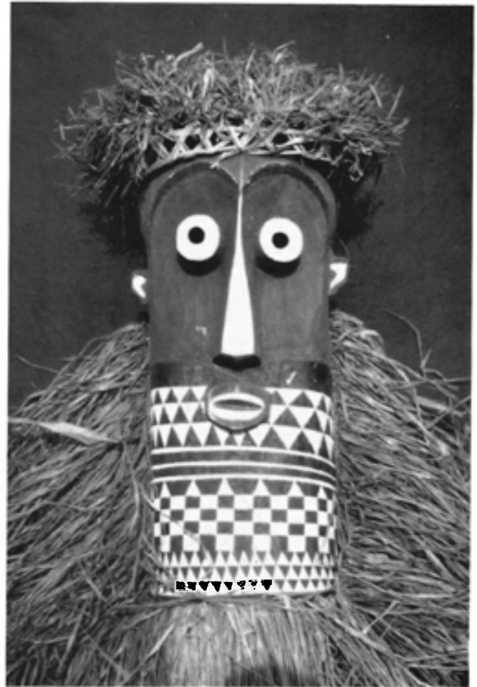
10. PHUMBU, THE KILLER, KASAI. CARVED BY KUOTSHAKANO, CHIEF OF KUOTSHAKANO VILLAGE, AND DANCED IN CERTAIN CHIEFLY INAUGURATIONS.

underlying idea is that the initiates are outside of society during their transition, and are thus "in nature." Indeed, the camps are held in deep bush during dry season when the grass is tall. The third category, exemplified by the mask panyangombe (Fig. 5), is most frequently associated with chiefly symbols of office. The mask is displayed prominently on the insignia houses of chiefs of the various orders. The majority of masks in eastern Pende society are thus subsumed to categories that structure life and thought.