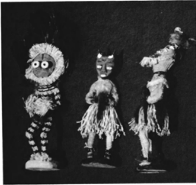
6. MINIATURE "DOLL" MASKED FIGURES, BANDUNDU PROVINCE, OF THE SORT SOLD BOTH LOCALLY AND AT IVORY MARKET IN KINSHASA.