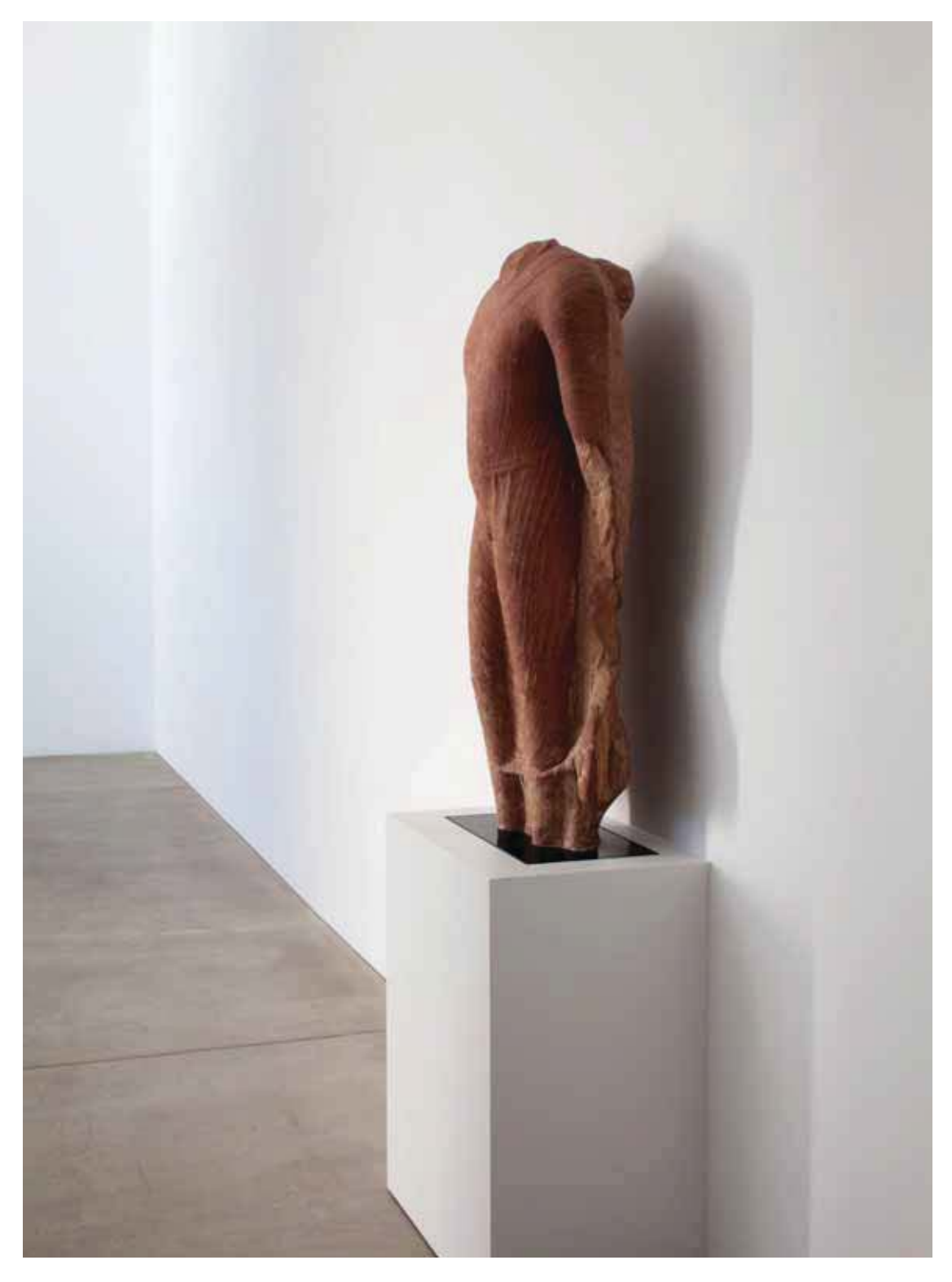
Fig. 12. Torso of a Buddha. 5th c. Gupta period. Mathurā, Uttar Pradesh, India. Mottled red sandstone. 113 \times 54.6 \times 21.6 cm. The Nelson-Atkins Museum of Art, Kansas City, Missouri. Purchase: William Rockhill Nelson Trust. Acc. no. 45-15.