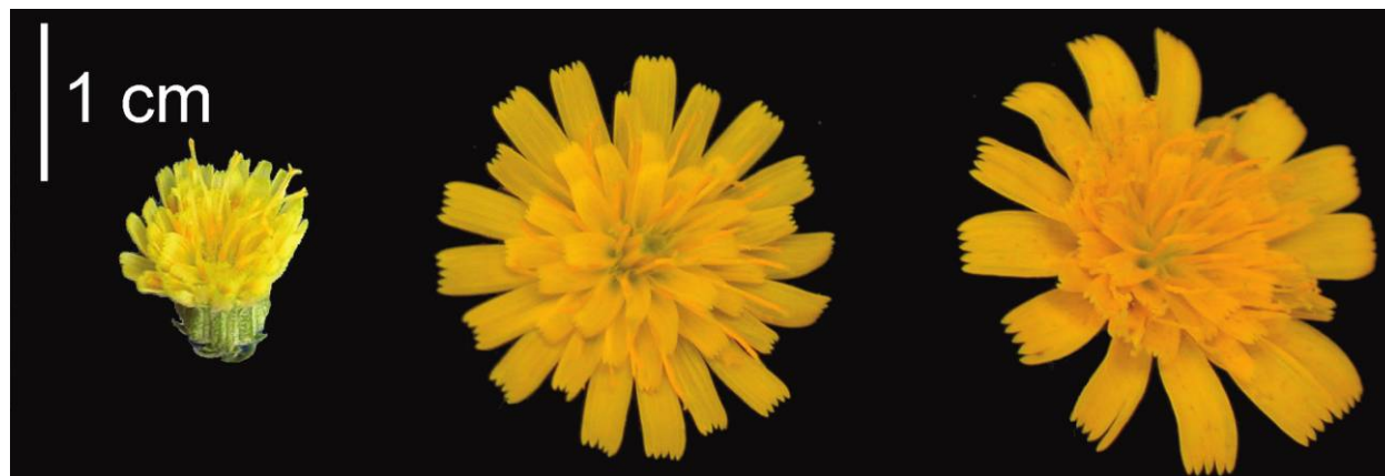
Fig. 2 Capitula from two populations of Tolpis , as well as a capitulum from their F 1 hybrid. From left to right: Tolpis coronopifolia (population 6, categorized as self-compatible), F 1 hybrid, and Tolpis sp. nov. 1 (population 39, categorized as self-incompatible; see table 1).

Inference of the breeding system of the common ancestor of Canary Island Tolpis has been complicated by the apparent rapid diversification of this clade. Very low levels of sequence divergence in nuclear ITS (R. K. Jansen, personal communication) and noncoding plastid regions (Mort et al. 2007), as well as a paucity of DNA restriction site variation (Moore et al. 2002), have precluded robust resolution of phylogenetic relationships in Canary Island Tolpis . Archibald et al. (2006) employed inter-simple sequence repeat (ISSR) markers to infer relationships and found that the two populations of the only SC endemic species of Tolpis ( T. coronopifolia ) are strongly supported as a clade and nested high within the tree, suggesting that this species is derived from PSC ancestors and that the colonizing