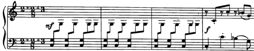
Example 25. Béla Bartók, Mikrokosmos , Vol. 6, No.149, m. 1-4.