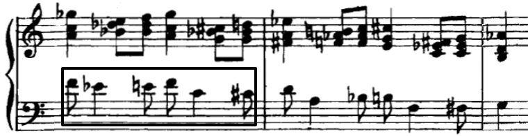
Example 23. Béla Bartók, Bagatelles , Op. 6, No. 10, m. 3-5.