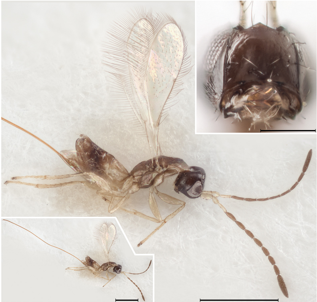
Figure 5. Habitus photographs of female of Borneomymar madagascar Huber, from Madagascar: Fianarantsoa, Massif de Andringitra (CAS); lower left inset shows entire specimen; the center of the compound eye is collapsed (scale bars = 500 µm). Top inset shows head, anterior view (scale bar = 100 µm).

geographic centers have shifted, and permitted the lineage to avoid strong selection for morphological change, or extinction. This same phenomenon is known in various groups of insects, some of more than twice the geological age (Engel & Grimaldi, 2002; Clarke & Chatzimanolis, 2009; Cognato & Grimaldi, 2009; Chatzimanolis et al. , 2013). Borneomymar pankowskiorum represents the most primitive genus of extant Mymaridae that has been found in Tertiary deposits. No Cretaceous species of Mymaridae has yet been found in Tertiary deposits or vice versa.