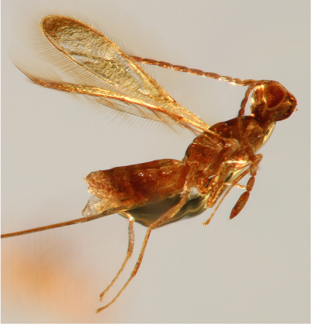
Figure 3. Detail of holotype female (SEMC F001019) of Borneomymar pankowskiorum , new species.

are glabrous); venation extending 0.66\times forewing length (venation length 690) (Figs. 3, 4); longest marginal setae 0.57\times as long as greatest wing width. Metasoma with short petiole, and with total length slightly more than mesosoma; gaster height about 0.4\times its length, terga of relatively equal lengths; posterior four terga bear short, inclined setae along posterior margins; hypopygium large, translucent, projecting distinctly beyond gastral apex (Figs. 1–3); ovipositor greatly elongate, much longer than twice entire body length (Figs. 1, 2, 4), without setae along exerted length.