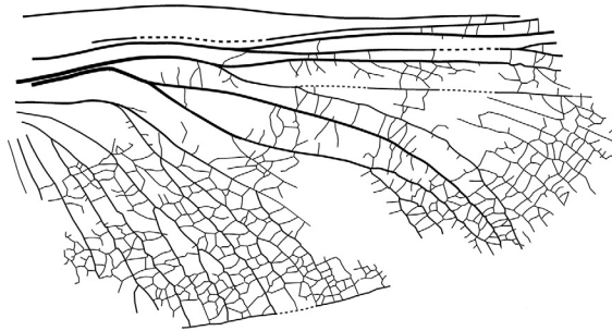
Pharciphyzelus lacefieldi Beckemeyer & Engel, 2011