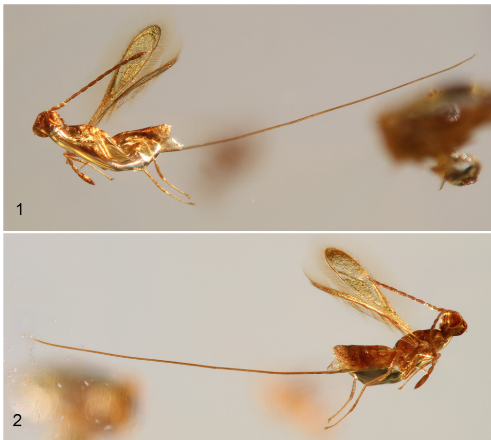
Figures 1–2. Photographs of holotype female (SEMC F001019) of Borneomymar pankowskiorum , new species. 1. Left lateral habitus. 2. Right lateral habitus.