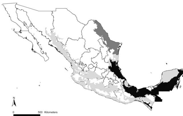
FIGURE 4. Ecoregions where leishmaniasis transmission is known to occur in Mexico. Moist forests are in black, Tamaulipan mezquital is in dark gray, and tropical deciduous forests are in light gray.

In Nayarit, cases have been related to coffee plantations, and recent records of infected patients with Lu. nia mexicana