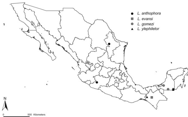
FIGURE 2. Known occurrence points for non-modeled Lutzomyia species, Mexico.

Leishmaniasis transmission in the states of Campeche and Quintana Roo is related to areas of moist forest, suggesting that infection is occurring by human proximity to areas with