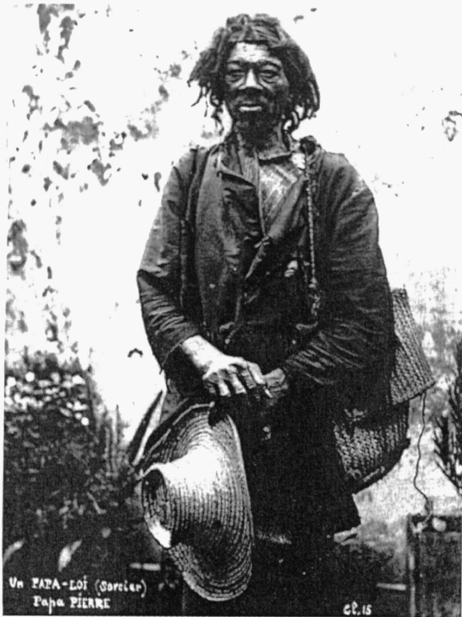
The above picture shows a papalwa , or Vodou priest from 1908.