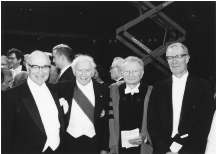
FIGURE 2. In Stockholm in December 1991 at reunion of the Nobel Prize winners. Left to right are Kenneth Arrow, Franco Modigliani, Paul Samuelson, and Robert Solow.