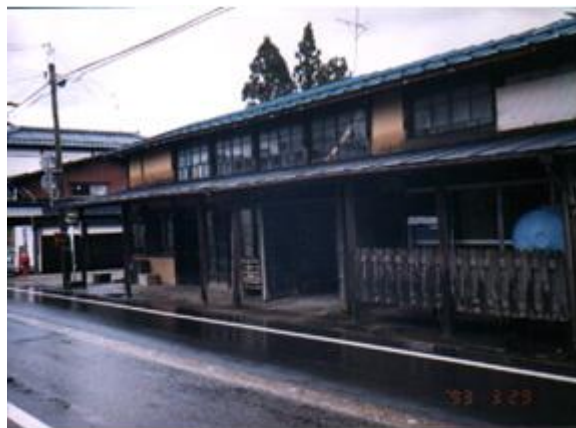
A part of the shopping district of Muramatsu as it used to be

As it was with a sense of relief that we were shaken out of our long nightmarish dream, it was not surprising that people generally showed no enmity or resentment against the Americans when they knew that they did no harm to innocent people. At the same time, they realized that it was the best opportunity for them to make money.