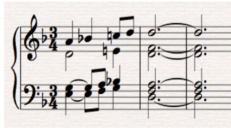
Example 1: Fauré, Pelleas et Melisande no. 4 ("La mort de Melisande"), mm. 61-62

It should not come as a surprise that one of the most fascinating aspects of his incidental music to Pelleas et Melisande is his use of harmony, and many of the