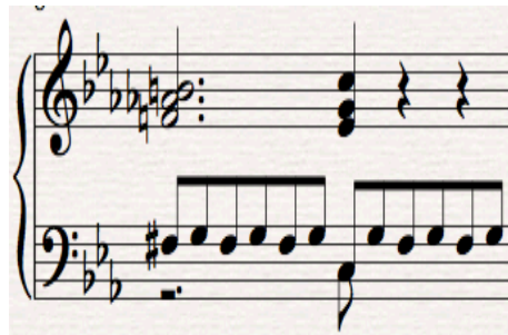
Example 17c: Sibelius Pelleas et Melisande ("Melisande at the Spinning-Wheel"), m. 25. (g minor chord)

The chord we have here is the f#°7 and g minor: vii°7 and v in measure 25. In measure 29, b fully-diminished chord and c minor chords: viio and i. In measure 34, Sibelius uses same chord patterns previously used in measure 7 through 10. In measure 48 through 53, the chord progression is: c minor, Bb Major, Ab Major, G6, F6, G6, Ab, Bb. At m. 53 he begins in Eb Major then arrives in c minor: again, the third relationship between Eb and C is evident, although this time it takes the form of a simple relative major to minor. Measure 58 marks the beginning of A'. The chord progression and structure is relative-major to minor and is the same but