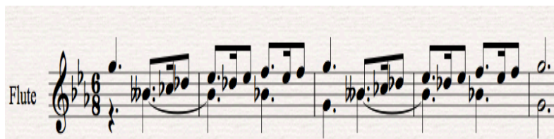
Example 7: Fauré, Pelleas et Melisande no. 3 ("Sicilienne"), mm. 58-61.

An unusual melodic feature found in the music to Pelleas et Melisande occurs in measures 58-61 of no. 3 ("Sicilienne"), where Fauré writes a whole tone scale (Example 7). This is quite unusual for Fauré, who usually only made use of portions of the whole tone scale, sometimes modifying it with leading tones.