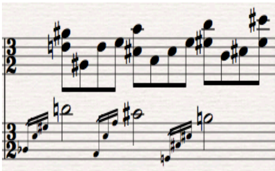
Example 11a: Sibelius, Pelleas et Melisande no. 1, mm. 29

Another important harmonic element is the frequent use of the augmented sixth chords, especially the French sixth. The first appearance is in m. 29, with a French sixth in D major on beat one, and a French sixth in b minor—the relative minor of D Major—leading to an unexpected arrival in F# major at m. 30. Shortly thereafter on beat two in m. 33, there is a French sixth in F# Major, with the final French sixth in measure 35 resolving to G# Major, V in the key of C# Major (See Example 11).