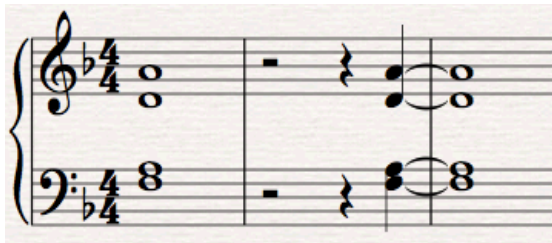
Example 22a: Sibelius, Pelleas et Melisande no. 8 ("The death of Melisande"), mm. 1-3.

This final movement of Pelleas et Melisande begins in D minor, with a move to the parallel major in the middle section at m. 35. The main theme returns at m. 47 and the movement concludes with an expanded version of mm. 10-12. Given the subject matter, it is not surprising that the general mood and character of the piece is dark, with the head motive of the theme appearing frequently in the outer sections, although it is conspicuously absent in the B section (See Example 22).