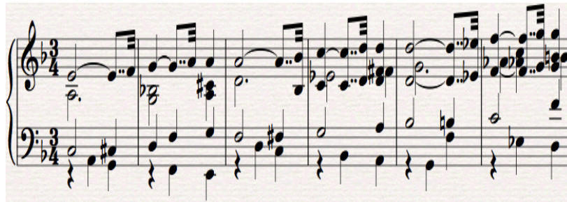
Example 4: Fauré, Pelleas et Melisande no. 4 ("La mort de Melisande"), mm. 13-18.

Fauré relied on the traditional harmony system, but uses it in a way that no composer before him had imagined. Interestingly, he did not conceive the harmonic milieu of his works by confining himself to a specific key or mode.