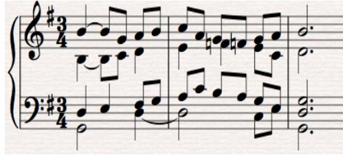
Example 3: Fauré, Pelleas et Melisande no. 1 ("Prelude"), mm. 86-88

Fauré relied on the traditional harmony system, but uses it in a way that no composer before him had imagined. Interestingly, he did not conceive the harmonic milieu of his works by confining himself to a specific key or mode.