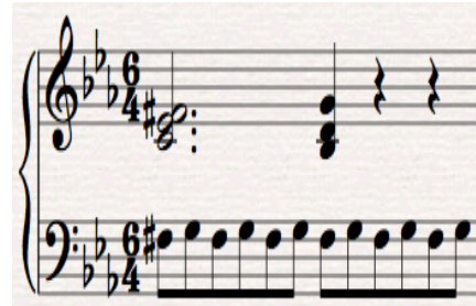
Example 17b: Sibelius Pelleas et Melisande ("Melisande at the Spinning-Wheel"), m. 25. (g minor chord)