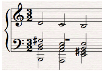
Example 13a: Sibelius, Pelleas et Melisande , no. 1 m. 5.

S.S: We shall never be able to clean all this. Third Servant: Bring water! Bring water!