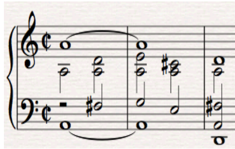
Example 12: Sibelius, Pelleas et Melisande no. 1, mm. 19-21.

dominants before settling in D Major in m. 21 by way of PAC. However, he moves immediately back to C Major in the next measure, conspicuously outside the norm of common practice tonality (See Example 12). Normally, when composers change keys, they usually stay there. However, Sibelius changes the rule to his advantage.