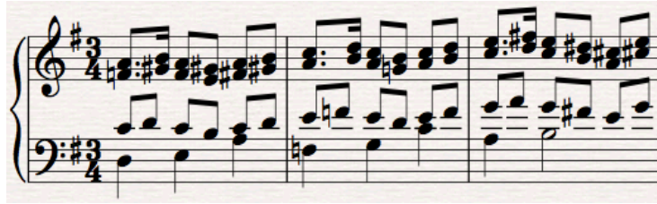
Example 5: Fauré, Pelleas et Melisande no. 1 ("Prelude"), mm. 8-10.

("Prelude"), for example, he uses ascending thirds with transposition (See Example 5).