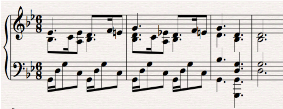
Example 2: Fauré, Pelleas et Melisande , no. 3 (“Sicilienne”), mm. 83-86

A plagal cadence is also featured at the end of no. 3 (“Sicilienne”), in which Fauré vacillates between the raised and lowered third of the subdominant chord before making a final resolution to the tonic (See Example 2).