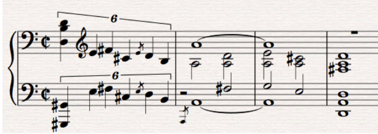
Example 10: Sibelius, Pelleas et melisande no. 1 ("At the castle-gate"), mm. 18-21.

Another important harmonic element is the frequent use of the augmented sixth chords, especially the French sixth. The first appearance is in m. 29, with a French sixth in D major on beat one, and a French sixth in b minor—the relative minor of D Major—leading to an unexpected arrival in F# major at m. 30. Shortly thereafter on beat two in m. 33, there is a French sixth in F# Major, with the final French sixth in measure 35 resolving to G# Major, V in the key of C# Major (See Example 11).