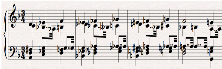
Example 6: Fauré, Pelleas et Melisande no. 4 ("La mort de Melisande"), mm. 20-24.

Likewise, in measure 20-23 of no. 4 ("La mort de Melisande") he creates incredible tension by employing a sequence that rises by minor seconds, thus allowing him to make use of intense chromatic harmonies (See Example 6).