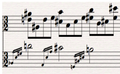
Example 13b: Sibelius Pelleas et Melisande no. 1 ("At the castle-gate"), m. 29

This scene is a hint that the show is about to start. The servants are trying to clean the castle. The scene does not indicate any seriousness nor predict the future of Pelleas et Melisande .