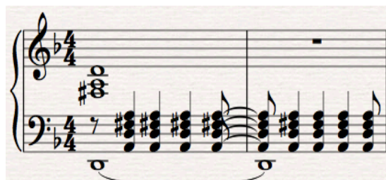
Example 22b: Sibelius, Pelleas et Melisande no. 8 ("The death of Melisande"), mm. 38-39