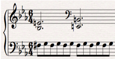
Example 17a: Sibelius, Pelleas et Melisande ("Melisande at the Spinning Wheel"), m. 21 (E minor chord)

minor beginning at m. 25. This is the minor v of c minor, but also the third of E minor, although the B natural is lowered to Bb (See example 17).