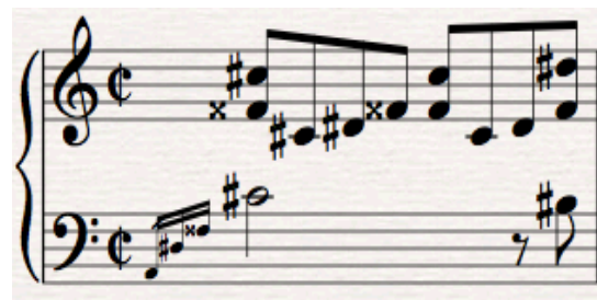
Example 11b: Sibelius Pelleas et Melisande no. 1 ("At the castle-gate"), m. 35

The movement begins in C Major, modulating to the dominant in m. 7 and returning to an imperfect authentic cadence (IAC) on C in m. 10. This is followed by a striking move to F# in m. 30 and a colorful walk through various secondary