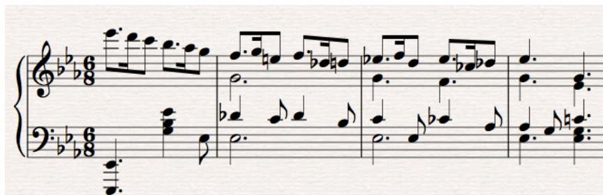
Example 9: Fauré, Pelleas et Melisande no. 3 ("Sicilienne"), mm. 44-47.

The countermelody at measure 44 of no. 3 ("Sicilienne") is especially effective, creating a conversational atmosphere between the flute, solo cello, and horn (See Example 9). These should be regarded as isolated examples, however, in a score that is admittedly sparse in contrapuntal devices.