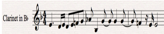
Example 23: Sibelius, Pelleas et Melisande no. 8 ("The death of Melisande"), mm. 21-23