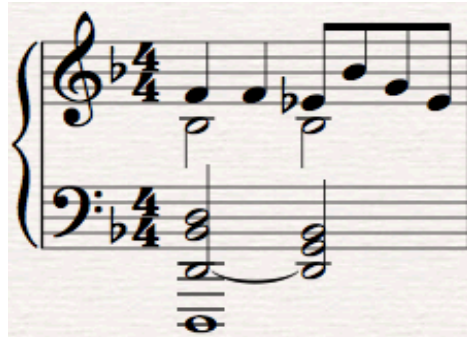
Example 24: Sibelius, Pelleas et Melisande no. 8 ("The death of Melisande"), m. 7.

Another significant feature of this movement is the use of the Phrygian mode, both melodically and harmonically. For example, in measure 7, D Phrygian occurs in the penultimate measure of the main theme (See example 24). Sibelius depicts Golaud's quiet frustration about Pelleas and Melisande with the violin and cello. At the end, Melisande is drifting away from Golaud without acknowledging or accepting her guilt.