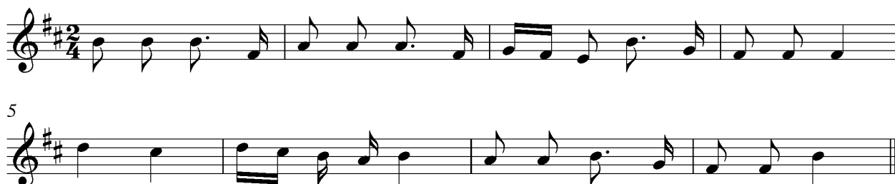
Example 1: Two Doves bolted into the blue original tune. Dziedot Dzimu Dziedot Augu . Latviešu tautas dziesmu krājums bērnu mūzikas skolām. Rīga, 1974.