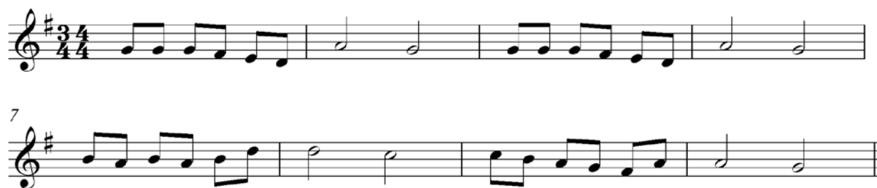
Example 4: Tall hills beyond the lake original tune. Dziedot Dzimu Dziedot Augu . Latviešu tautas dziesmu krājums bērnu mūzikas skolām. Rīga, 1974.

Example 4 shows the original folk tune from Tall hills beyond the lake . This material is first introduced in measure 13, after an introduction that is built around the rhythm and pitch of the original theme. The introduction is marked Con moto, poco rubato (quarter note=100), but when it arrives at the original theme the marking is Poco meno mosso (quarter note=80). After the theme it returns to Tempo I and with a short three-measure interlude goes back to the beginning material and is almost identical. As before, the original theme follows, but this time an octave lower, leading to a short Coda.