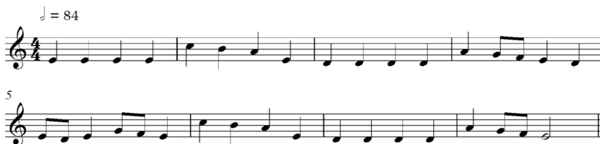
Example 7: Compiled by G. Dovgjallo. Ziedi Ziedi Rudzu Vārpa: Latvian Folk Songs . Riga: Liesma, 1980.

marking Moderato (half note=72). Example 7 shows the original folk tune which, unlike in other movements, matches the known folk tune note-for-note. The only difference is the choice of meter, because Kalsons used 2/2 instead of 4/4.