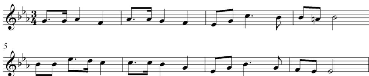
Example 12: Sun Late At Night original tune. Dziedot Dzimu Dziedot Augu . Latviešu tautas dziesmu krājums bērnu mūzikas skolām. Rīga, 1974.