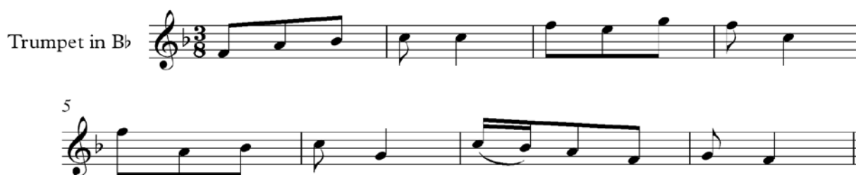
Example 6: Romualds Kalsons. Six Latvian Folksong Arrangements - I'll Build a Bridge With Alder Tree Buds . Manuscript, excerpt. Riga, 1981