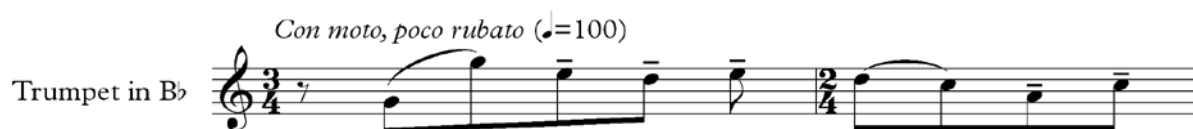
Example 5: Romualds Kalsons. Six Latvian Folksong Arrangements - Tall Hills Beyond The Lake . Manuscript. Riga, 1981.

The interesting difference between the original tune and the one that Romualds Kalsons uses is the fact that every measure is in a different meter following the pattern of 3/4, 2/4, 4/4. However, that does not apply when he quotes the original material, because that is in an unchanging 3/4, unlike the original from Example 4.