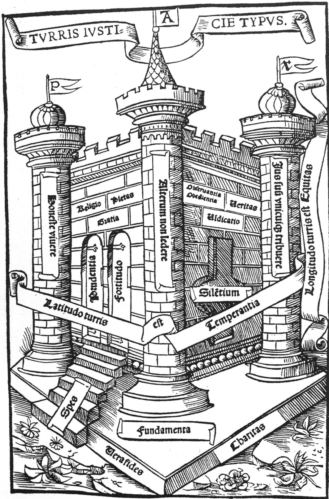
The tower of justice, on a foundation of charity and true faith, approached by the stairs of hope, and built of truth and other virtuous qualities.