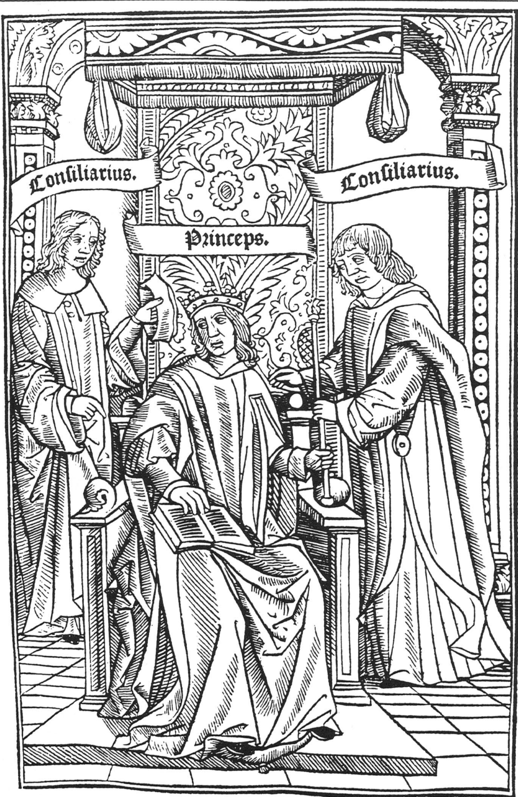
The king with his law book and his two legal interpreters.