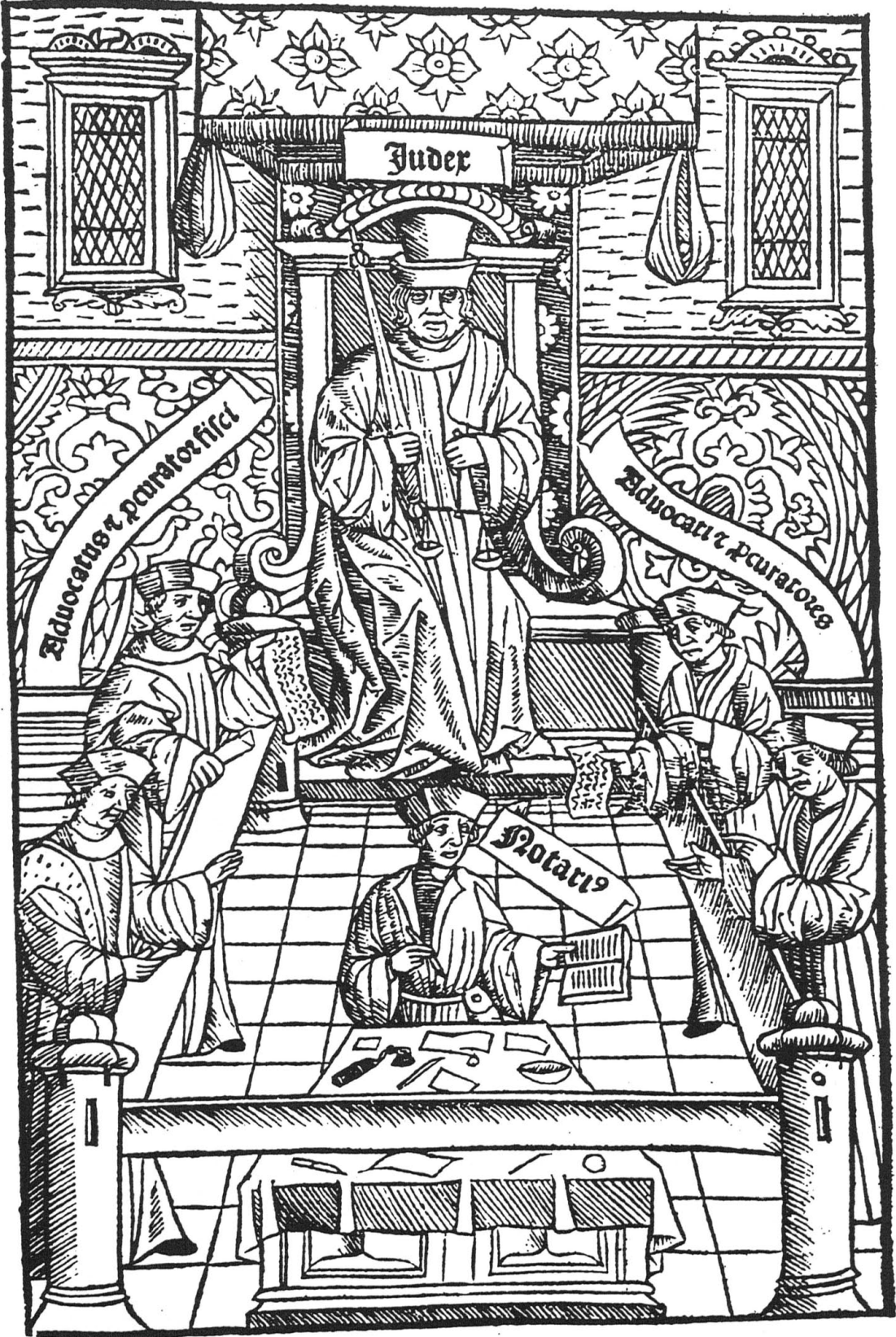
The judge, with the lawyers for the two parties to the case and (in the foreground) the notary recording the proceedings.