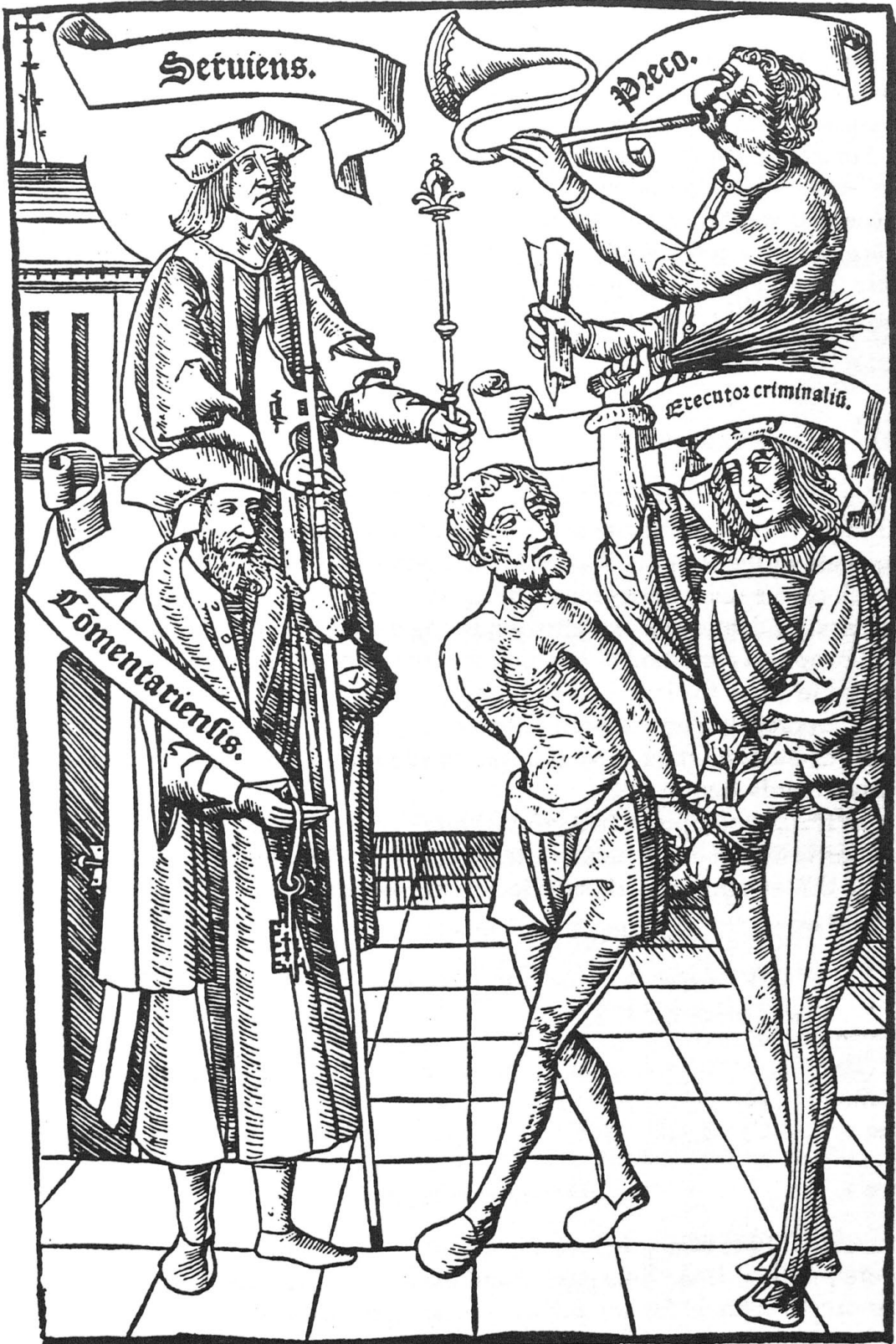
The convicted criminal with four court officers, one carrying out the sentence.