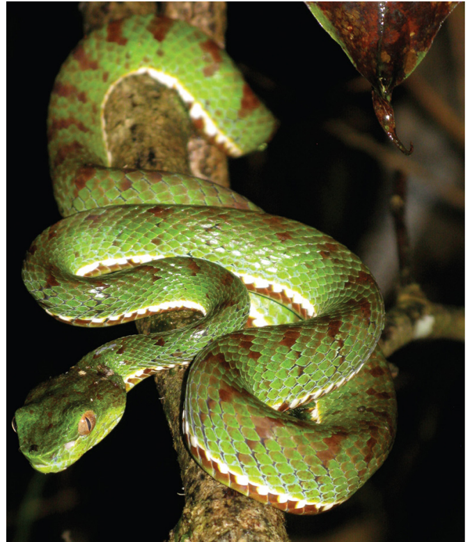
FIGURE 35. Parias flavomaculatus in life (KU 323395; Location 2).