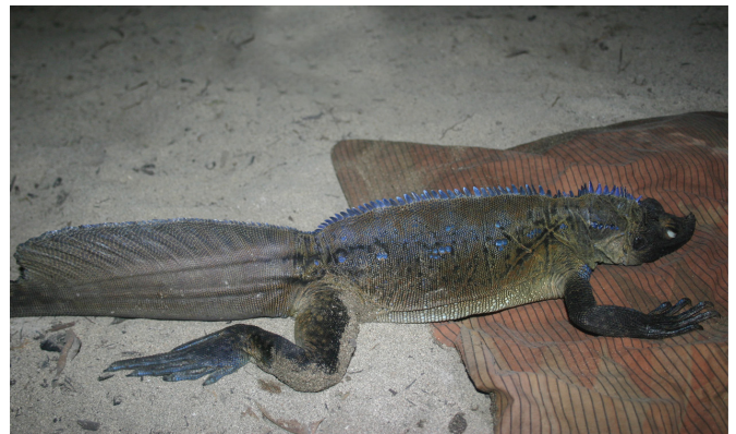
FIGURE 26. Hydrosaurus pustulatus in life (KU 325294; Location 6).

We collected individuals of this species at night on branches suspended over a river. It is known to occur on all major, and many small and isolated, Philippine islands except for Palawan. Figure 26. Location 1: KU 232161; Location 2: KU 323160; Location 3: 323162-3; Location 6: KU 325294.