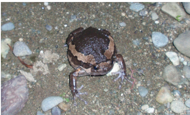
FIGURE 21. Kaloula pulchra in life (KU 322393; Location 3).

We collected this species under loose soil and leaf litter in a residential yard in the town of Baler. Until recently, this species was known to have a widespread distribution throughout much of southeast Asia except for the Philippines; however, it has now been introduced to the country, has recently been documented on Luzon (Diesmos et al. 2005), and likely occurs on other Philippine islands. Figure 21. Location 3: KU 322393.