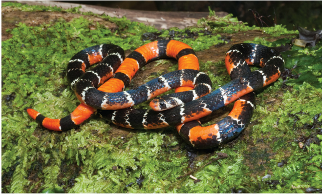
FIGURE 33. Hemibungarus calligaster calligaster in life (KU 323337; Location 5).

extirpation efforts around the country, the species appears to have become rare on many islands. We collected a single individual of this species on the surface of the forest floor in secondary-growth forest. Location 2: KU 322351.