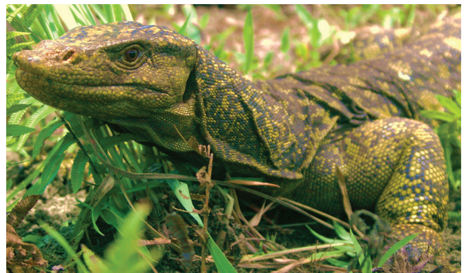
FIGURE 29. Varanus bitatawa in life (PNM 9728 ; Location 6).

A single individual of this newly described frugivorous species of monitor lizard was salvaged from a hunter (Welton et al. 2010b). This species is morphologically distinct from Varanus olivaceus , which is known to occur in the small remnant forest patches in southeastern Luzon, The Bicol Peninsula, Catanduanes, and Polillo Islands (Auffenberg 1988; Welton et al. 2010b). Frugivorous monitors in the Philippines have been documented to eat the fruits of several palm species ( Corphyra elata , Livistonia rotundifolia , Caryota sp.), fig species ( Ficus altissima , F. merritti , F. benjamina , F. baletae ), and pandanus ( Pandanus tectorius ) fruits (Auffenberg 1988). According to the local community, the species is commonly collected by hunters and individuals in the area have been observed in coastal disturbed and secondary-growth forest. Figure 29. Location 6: PNM 9728 (formerly KU 320000).