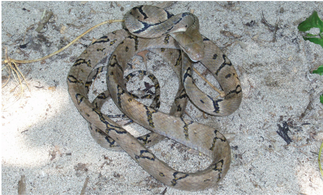
FIGURE 30. Boiga cynodon in life (KU 322354; Location 6). Photo by LJW.

We collected this species in arboreal habitats in disturbed and secondary-growth forest. Individuals were encountered actively hunting at night on branches of trees and shrubs in the forest. This species is currently recognized to occur on Palawan, Mindanao, Luzon, and Panay Islands (Leviton 1963b; 1970; Alcalá 1986; Ferner et al. 2000; Gaulke 2001). Figure 30. Location 2: KU 322355; Location 3: KU 322356-7, 323367; Location 6: KU 322354.