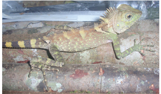
FIGURE 25. Gonocephalus sophiae in life (KU 323153; Location 2).

We collected individuals of this species at night asleep on the trunks of small trees and saplings in secondary-growth forest. It was often found perched on sapling trunks in an upright position 1-2 m above the ground. We believe this is the same species as the unidentified species of Gonocephalus collected during the Brown et al. (2000b) expedition. Figure 25. Location 2: KU 323153-6; Location 5: KU 323157-8; Location 6: KU 323159.