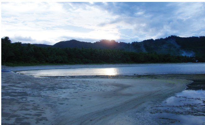
FIGURE 14. Coastal forest habitat at Location 6.