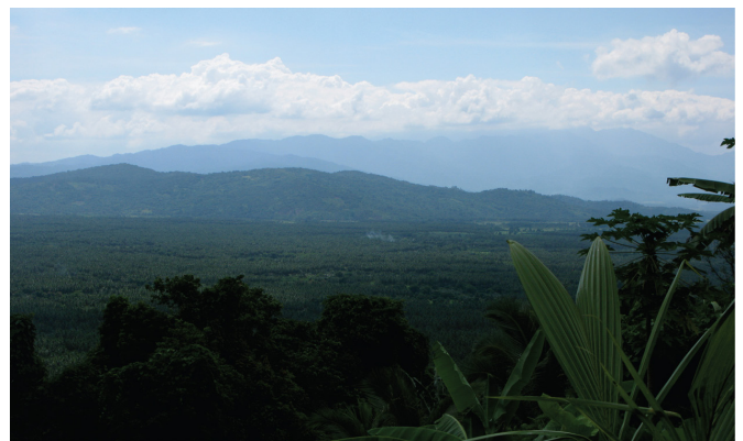
FIGURE 6. View of lowlands from Location 3.