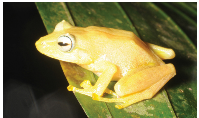
FIGURE 18. Platymantis polillensis in life (KU 322125; Location 1).