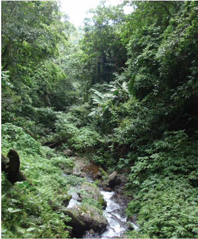
FIGURE 12. River system at Location 5.