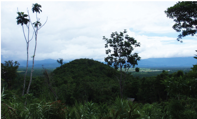
FIGURE 8. Lowland habitat at Location 3.