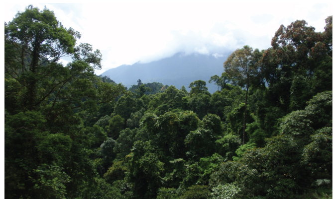
FIGURE 4. Mountain view at Location 2.