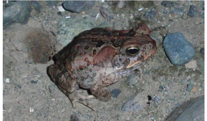
FIGURE 12. Rhinella marina in life (KU 321853; Location 3).

We observed individuals of this introduced and invasive species around the Aurora State College of Technology campus and in the town of Baler. This species is common in highly disturbed habitats and can often be heard calling in loud breeding choruses in flooded agricultural fields. Figure 15. Location 3: KU 321853-62.