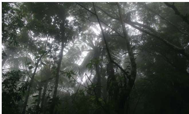
FIGURE 2. Cloud forest at Location 1.