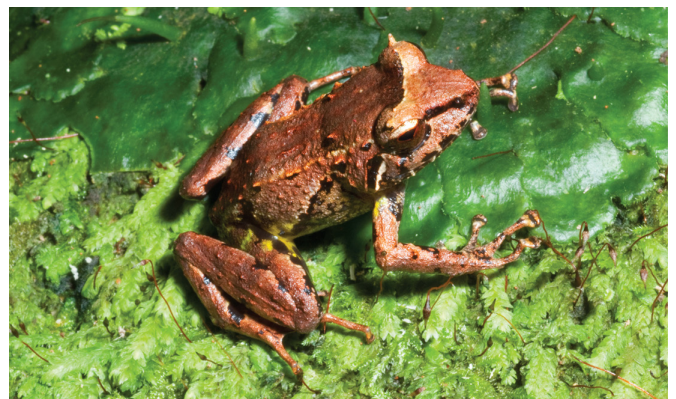
FIGURE 16. Platymantis cf. cornutus in life (KU 322471; Location 5).

We collected individuals of this species on low hanging tree branches, leaves, and shrubs, in similar habitat to Platymantis cf. luzonensis (see below). Males were frequently heard at Locations 2 and 4, calling from forest canopy, with advertisement calls identified by their rapid note repetition rate and relatively high numbers of notes per call. Figure 16. Location 1: KU 321985-93, 322051-64, 323412; Location 2: KU 321953; Location 4: KU 322463-5, 323415; Location 5: KU 322469.