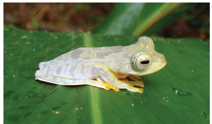
FIGURE 23. Rhacophorus bimaculatus in life (KU 323006; Location 2).

Specimens of this species were collected on the branches and leaves of shrubs near swampy habitat and pools of water in disturbed and secondary-growth forest. This species is known to have a widespread distribution throughout much of the Philippines, and is known to build foam nests on vegetation above stagnant pools of water. Figure 23. Location 2: KU 322207-8, 323006.