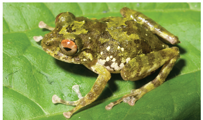
FIGURE 19. Platymantis sp. 1 “green” in life (KU 322144; Location 1).