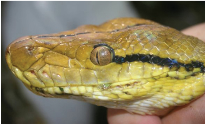
FIGURE 37. Python reticulatus in life (KU 325296; Location 2).

The results of our surveys provide additional baseline data on the diversity of amphibians and reptiles in the southern Sierra Madres mountain range, Aurora Province (Table 1, Figure 1). The species encountered during the surveys include many interesting discoveries, potentially new and endemic species, and additional information on rare species known previously from few observations and specimens. Although much of the habitat we explored in recent surveys was secondary-growth regenerating forest at best, high species diversity was encountered at all sites. Several species, previously believed to be rare, have turned out to be quite common, including the stream frog Sanguirana tipanan , the “Polillo” forest frog P. polillensis , and the skink Sphenomorphus leucospilos . Unfortunately, we suspect that habitat disturbance brought about by rapid development of Aurora Province is most likely having a negative impact on the local herpetofauna. At all sites visited by us, signs of low-level timber harvesting was apparent. The invasive and introduced species Rhinella marina and Kaloula pulchra were observed during this survey, in contrast to their absence during the Brown et al. (2000b) inventory. Additionally, the recent