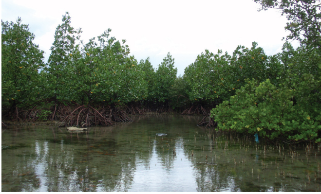
FIGURE 7. Mangrove forest at Location 3.