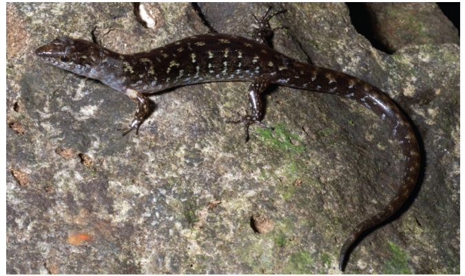
FIGURE 28. Sphenomorphus leucospilos in life (KU 323925; Location 5).

Prior to the collection of a single individual in 2000, this rare species was known from only two specimens collected on Luzon Island (Brown et al. 2000b). We observed this species active during the day on boulders on the banks of rapidly flowing river systems. When disturbed, individuals dove into the water or quickly crawled into crevices between rocks. Figure 28. Location 5: KU 323920-30.