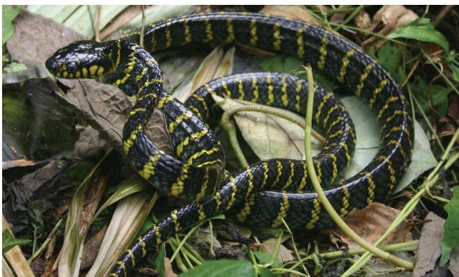
FIGURE 31. Boiga dendrophila divergens in life (KU 323366; Location 4).

This species was observed near rivers in disturbed and secondary-growth forest and in mangrove forest habitats. Individuals were encountered on the ground while actively hunting at night. This polytypic species occurs throughout the Philippines, and consists of four subspecies (Leviton 1970): B. dendrophila divergens (Luzon and Polillo Islands), B. dendrophila latifasciata (Mindanao Island), B. dendrophila levitoni (Panay Island), and B. dendrophila multicincta (Balabac and Palawan Islands). Figure 31. Location 4: KU 323366; Location 6: KU 323365.