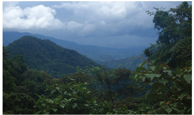
FIGURE 3. Mountain view on hike to Location 1.