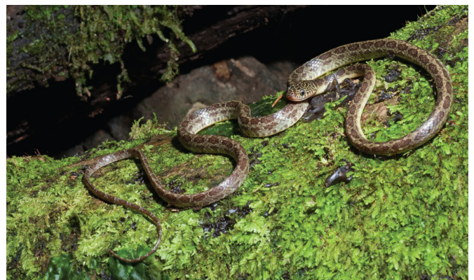
FIGURE 32. Lycodon muelleri in life (KU 323384; Location 5).

We collected this species on leaf litter on the forest floor in secondary-growth forest. This species of wolf snake has been recorded on Batan, Luzon, Mindoro, and Polillo Islands (Leviton 1965a). Figure 32. Location 2: KU 323383; Location 5: KU 323384-5.