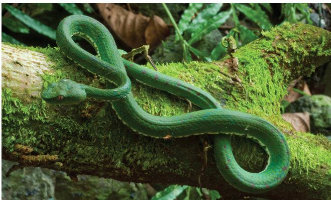
FIGURE 34. Parias flavomaculatus in life (KU 323399; Location 5).

We collected individuals of this species of pit viper coiled and asleep at night on branches of trees in secondary-growth forest. This polytypic species occurs throughout the Philippines and consists of three subspecies (Leviton 1964a): P. flavomaculatus flavomaculatus (Bohol, Camiguin, Catanduanes, Dinagat, Jolo, Leyte, Luzon, Mindanao, Mindoro, Negros, and Panay Islands), P. flavomaculatus halieus (Polillo Island), and P. flavomaculatus macgregori (Batanes Island Group). Some of our specimens clearly key out to P. f. halieus , and others (from the same population) key out to P. f. flavomaculatus . This suggests to us that the single color character used to distinguish the two “subspecies” is a color polymorphism that occurs throughout the range of this single, widespread species and does not correspond to a valid taxonomic entity that is endemic to Polillo Island. Figure 34-36. Location 2: KU 323394-6; Location 5: KU 323399-401.