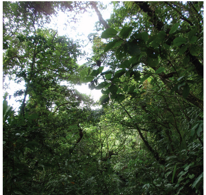
FIGURE 11. Forest habitat at Location 5.