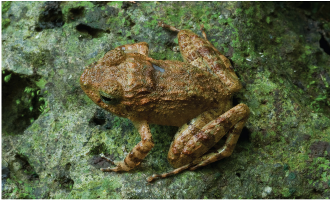
FIGURE 20. Platymantis sp. 2 "meeyak" in life (KU 322435; Location 5).

P. biak (Siler et al. 2010c), and P. insulatus (Brown and Alcala 1970). The calls of male individuals were quiet when compared with the calls of other sympatric species in the genus; males were observed calling solely from cascading stream banks, within the spray zone of high gradient and rapidly flowing water. Several were collected midstream on rocky and gravel banks. Figure 20. Location 1: KU 322042-50; Location 2: KU 322041; Location 4: KU 322437-42; Location 5: KU 322433-6.