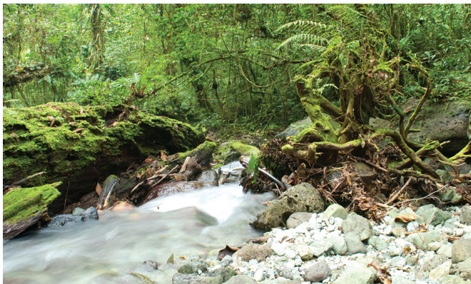
FIGURE 13. Rocky, river habitat at Location 5.