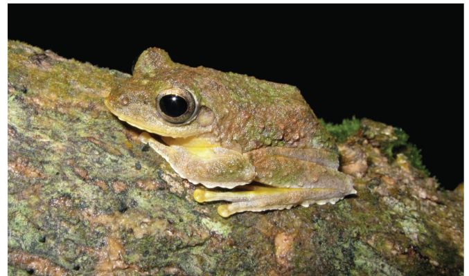
FIGURE 22. Rhacophorus appendiculatus in life (KU 322251; Location 2).

This infrequently encountered species is thought to have a widespread distribution throughout the Philippines, occurring in disturbed, secondary- and primary-growth forest. We encountered a large chorus of many dozens of individuals, situated on vegetation surrounding a stagnant, swampy pool in selectively logged forest. This is one of several Philippine anuran species known to build foam nests on vegetation overhanging pools of water (Brown and Alcala 1982b). Individuals were collected on the branches and leaves of shrubs surrounding small pools of water and swampy habitat. Figure 22. Location 2: KU 322209-53, 323413, 323418.