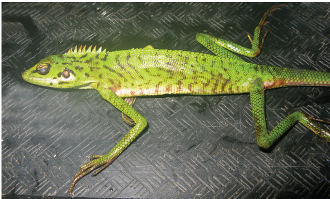
FIGURE 24. Bronchocela marmorata (KU 323045; Location 2).

We found this species asleep at night on branches of trees and shrubs in disturbed forest. Several specimens ostensibly match the definition of B. marmorata while others can be keyed out (Hallermann 2005) to B. cristatella (Kuhl, 1820). However, we hesitate to definitively identify two sympatric taxa given the slight character differences that putatively distinguish the two forms and the absence of genetic data suggesting the existence of two species on Luzon (Brown, Siler, Welton, and Diesmos, unpublished data). Individuals were often found 2-4 m above the ground. This species is widely distributed in the Philippines. Figure 24. Location 2: KU 323044-5; Location 3: KU 323046-9; Location 4: KU 323051; Location 6: KU 323050.