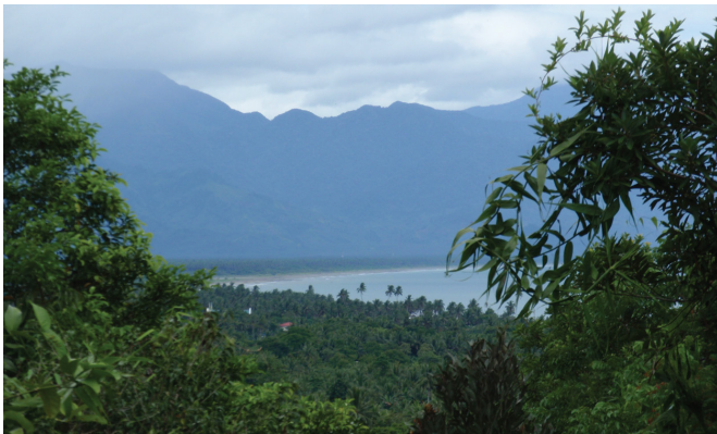
FIGURE 9. View of lowlands from Location 3.