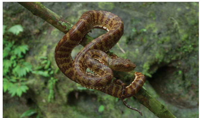
FIGURE 36. Parias flavomaculatus in life (KU 323400; Location 5).