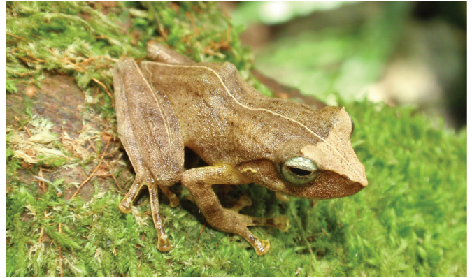
FIGURE 17. Platymantis polillensis in life (KU 322423; Location 5).

A third small-bodied P. hazelae group species (Brown et al. 1997a) has been identified in Aurora Province. This small, tuberculate form calls from saplings and understory leaves above 900 m and 2-3 m above the ground; its call sounds to the human ear like a loud, intense “Pssst!” This undescribed species has also been encountered on Mt. Mangan, Aurora Province (specimens in FMNH). Figure 19. Location 1: KU 322134-56.