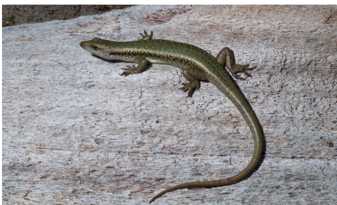
FIGURE 27. Emoia atrocostata in life (KU 323195; Location 6).

We collected two specimens of this species on sandy habitat near the coast at Casiguran. This species is widely distributed but seldom collected in recent years, most likely due to ubiquitous coastal development throughout the country. Figure 27. Location 6: KU 323195-6.