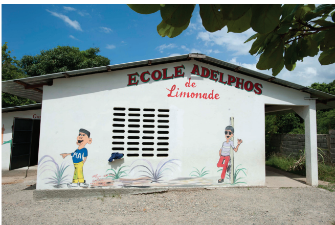
A new church school in Limonad

certainly urban, there is much less traffic. The community only felt the tremors of the earthquake, so the area has not had to undergo massive reconstruction. Here the markets seemed even bigger, more central to the economy. They are spread over main streets and small village roads. Given our interest in education, we ate dinner with a young pastor and his wife, who have built an Apostolic school that serves the lower and upper grades. They are missionaries in Limonad, and they are committed to the work of education and religion, for the two go hand in hand for them.