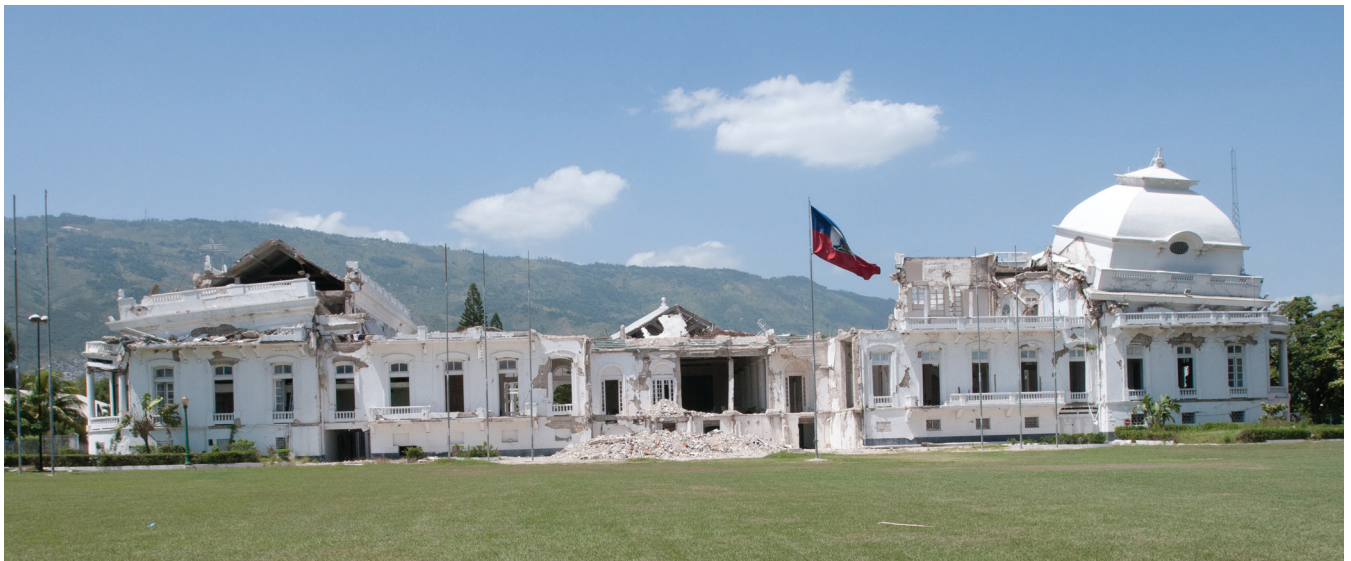
The Capitol, Port-au-Prince, July 2011