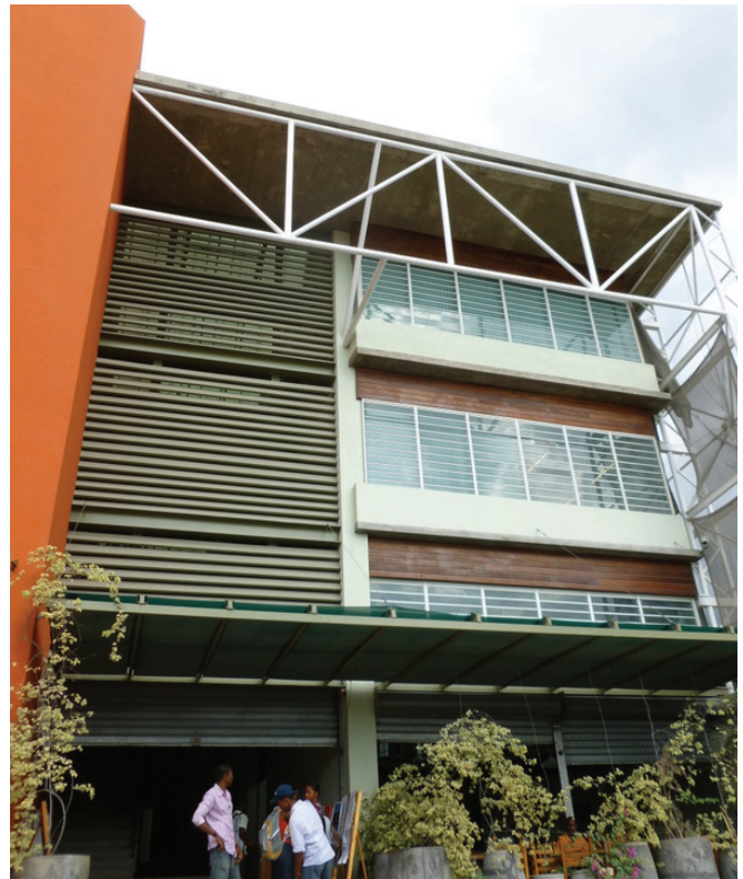
FOKAL cultural center

FOKAL's three-story cultural center in downtown Port-au-Prince provides a much-needed space in the city for "debate, leisure, and discovery." The building includes an