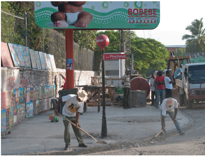
Street Sweepers Port-au-Prince