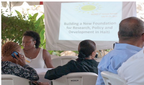
INURED research planning session

Havana of the 1950s gradually gave way to edgier sounds and different vocalists as a younger crowd drifted in. Still with a Latin beat, the music had begun to absorb the flavor