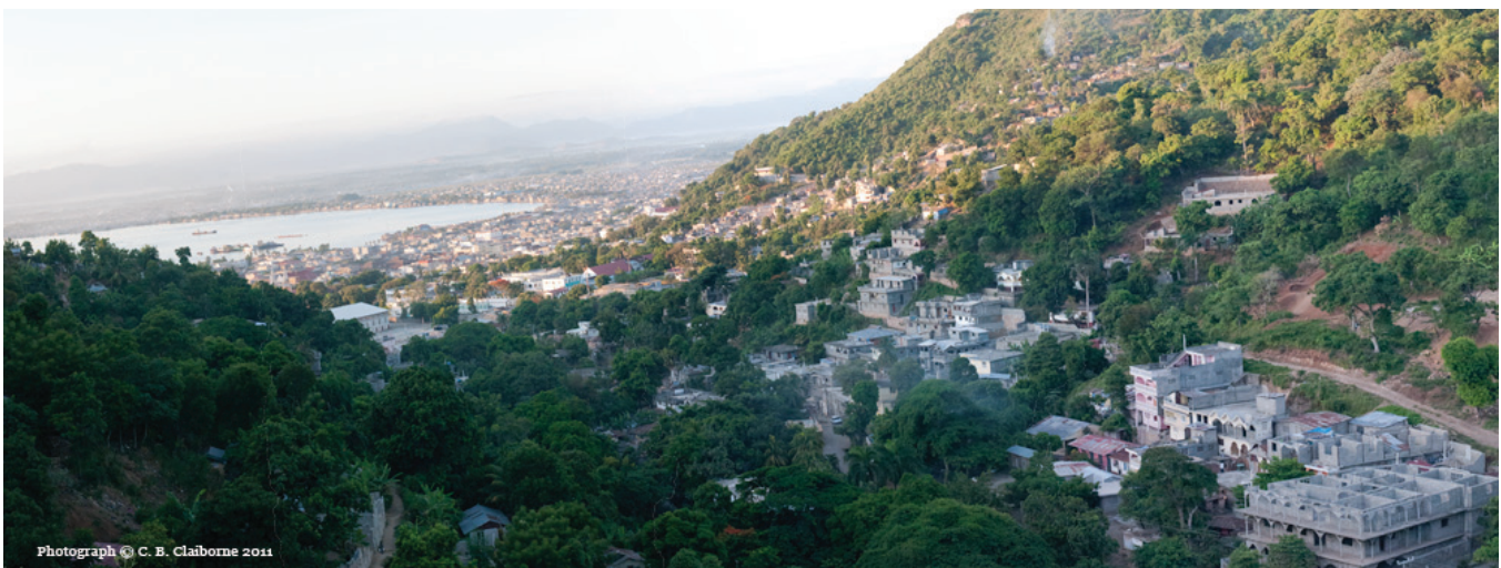
Morning light, Cap Haitien

A second journey away from Port-au-Prince took us north to Okap, the most historic part of the country. While the trip was scheduled before leaving the US, it was not until we arrived that we understood what might be involved. We elected to fly a local airline after comparing a half-hour plane ride to a possible two days by car. From the plane we saw little that might constitute a path through the mountains that could accommodate ground travel, confirming how easily one could get stuck during one of Haiti's spontaneous downpours. The experience on a domestic air carrier in Haiti is worth noting, however. In this land where money is a precious commodity that few can afford, those who have it gain access. Reservations matter not; credit card payments online do not guarantee a seat. The process is simple. One walks up, pays cash, and boards the prop plane. This continues until the twenty seats or so are filled. If you are lucky, and there are seats left, those