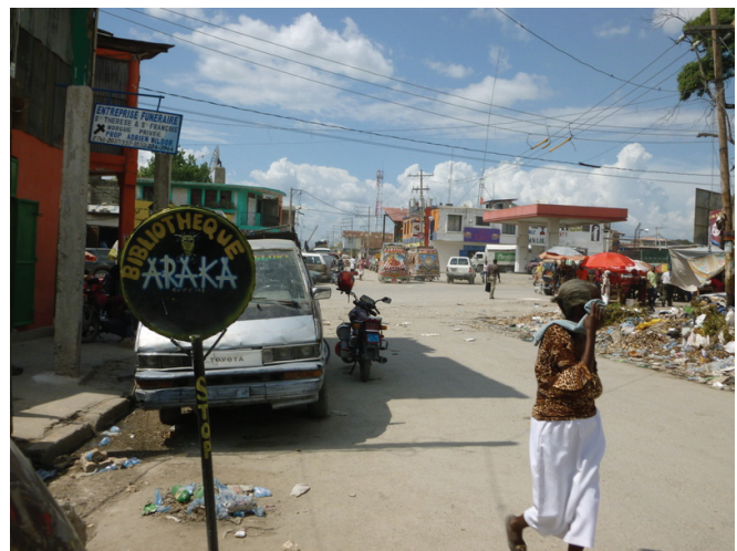
ARAKA library and cultural center

works, novels, and basic science books. These materials are primarily in French and were obtained largely from donations and other sources, including FOKAL. Located in an area hit hard by the earthquake, the building and library materials suffered significant damage, including all computer equipment. They are in need of building repairs,