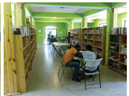
Mirbale Municipal Library