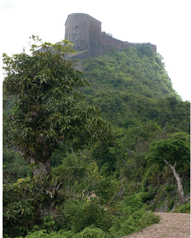
The Citadel from the road up