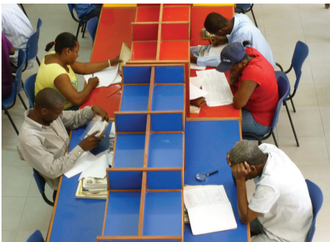
Reading room at the National Library of Haiti