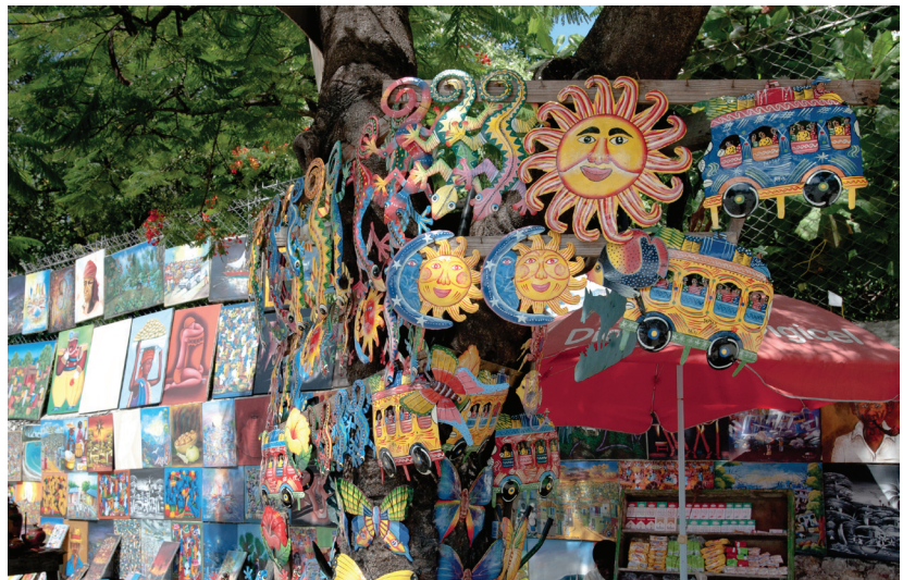
Haitian vendors art display on mountain wall

Haitian art is matched by a Haitian literary tradition that goes back to the country’s independence. Jeremi is called the “city of poets” because of the many poets, historians, and other writers who are associated with the town. 6 Jean Price-Mars, critic of the US Occupation of Haiti and founder of the indigenisme movement, challenged Haitian intellectuals to turn to their own culture—rather than to France—for inspiration and source material. Price-Mars’ ideas later influenced the Negritude movement, which emerged in Paris among Francophone intellectuals during the 1930s. Exchanges between Haitian and American writers during the early decades of the twentieth century were part of a larger trend of black internationalism, as scholars such as Brent Hayes Edwards have pointed out ( The Practice of Diaspora 2003). The relationship between Lawrence native Langston Hughes and Haitian writer activist Jacques Roumain, 7 for example, led Hughes to translate Roumain’s most famous novel, Gouverneurs de la Rosee/ Masters of the Dew (1944). For most of us, the exposure to