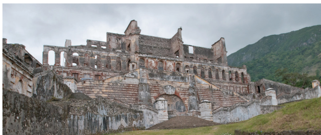
San Souci Palace, Cap Haitien

having become one of the richest colonies in the French empire, a half million enslaved Africans led by one of their own, Toussant L'Ouverture, waged a battle that resulted in their independence and the abolition of slavery. Haiti not only became the first black republic, but also it was the first Latin American country to gain its independence, and only the second independent republic in the Americas. 3 France did not give up easily and for a while, two “nations” existed in Haiti. The northern section of the country was consolidated under Henri Christophe. In the mountains overlooking Okap (Cap Haitien) sits the Citadel, an architectural wonder in its design. Its construction took the lives of 15,000 people. The Citadel, together with the palace of Sans Souci at the base of the mountain, represents a history of life and death, a testament to the determination, endurance, creativity, and resilience of the Haitian people.