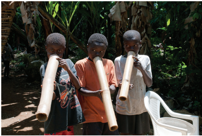
Okap young musicians with vaksins, hand-carved instruments

certainly urban, there is much less traffic. The community only felt the tremors of the earthquake, so the area has not had to undergo massive reconstruction. Here the markets seemed even bigger, more central to the economy. They are spread over main streets and small village roads. Given our interest in education, we ate dinner with a young pastor and his wife, who have built an Apostolic school that serves the lower and upper grades. They are missionaries in Limonad, and they are committed to the work of education and religion, for the two go hand in hand for them.