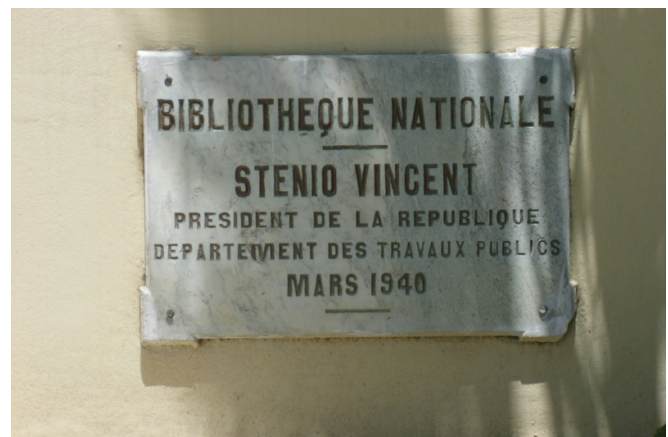
Haiti's National Library was founded in 1940

The BNH has several current international collaborations, in particular with the Bibliothèque Nationale de France, which is scanning and making digital versions of its Haitian materials available. The library is also participating in a distance-learning program for librarians with the Bibliothèque Nationale de France, the Association of French Librarians, and libraries in Martinique and Guadeloupe.