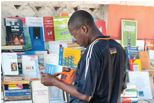
Reader at a book vender on the street in downtown Port-au-Prince

in Haiti’s long-term development and emergence from its condition of dependency and exploitation. Many of Haiti’s critical strategic issues, such as improving literacy and public education, are directly related to the missions of libraries and cultural organizations. Other issues (reforestation, public health, housing, globalization, land use) require the kind of research-support infrastructure that libraries and information professionals need to provide—building capacity for the gathering, management, and transmission of data in order to increase knowledge, strengthen governing and educational institutions, inform public policy decisions, and improve the quality of lives in Haiti.