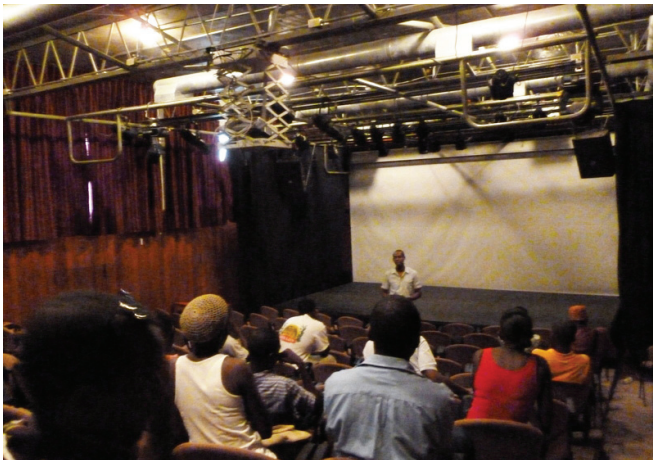
FOKAL cultural center

Created in 1995, FOKAL is an independent foundation in Port-au-Prince supported by George Soros's Open Society Foundations, the European Union, and other sources of funding. A well-recognized national organization in Haiti, FOKAL is active in a range of educational, cultural, and development activities in local communities. FOKAL's three strategic areas of activity are: reconstruction/environment, youth arts and education, and—of particular interest to library initiatives—access to information. In addition, FOKAL provides grant funding to specific initiatives from civil society, the artistic community, and the agricultural sector.