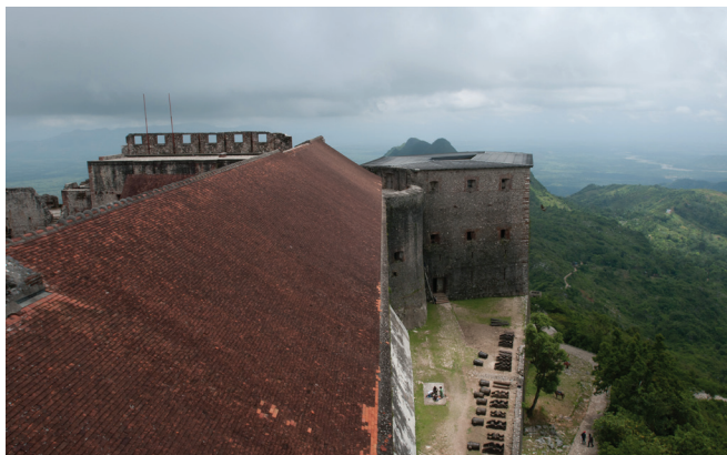
The Citadel from the upper level

The municipalities surrounding Okap, Limonad, and Labadi, in particular, are less dense in population, and while