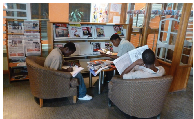
Monique Calixte Library at FOKAL

Internet café with free wireless access, a garden for hosting events and classes, a 140-seat auditorium with a regular schedule of films, plays and lectures, meeting and exhibit spaces, a video and sound studio, and the Monique Calixte Library, a public library with magazines, newspapers, books for adults and children. The library also houses an "American Corner"—an information space sponsored by the U.S. Embassy to provide information resources about the United States. On the afternoon that I visited, about 25 people were attending a showing of the PBS mini-series "John Adams" and public lecture in the auditorium, and the library was busy with patrons reading magazines, checking out books, and using the public computers.