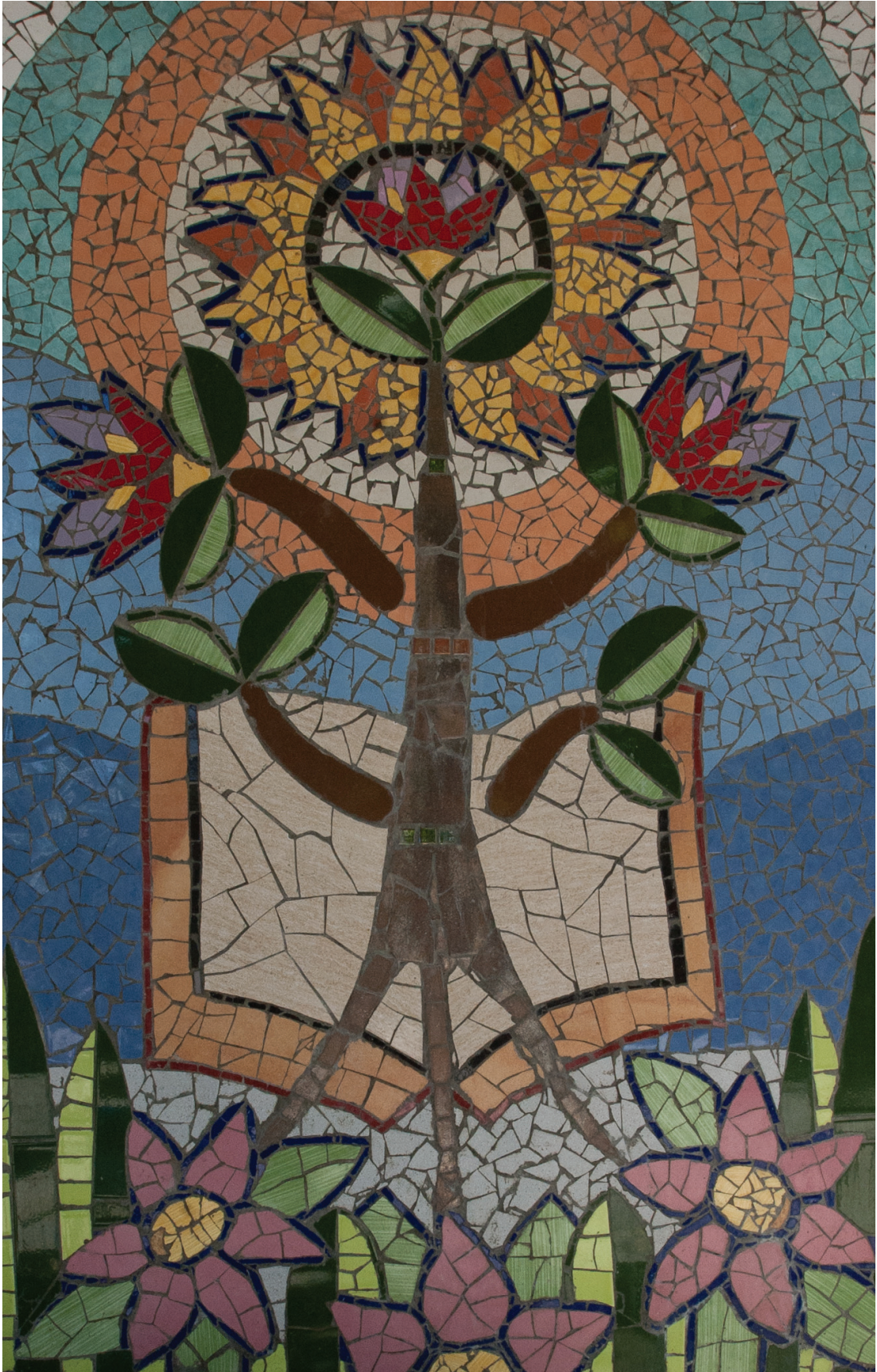
Mosaic in the garden of the Bibliotheque Nationale