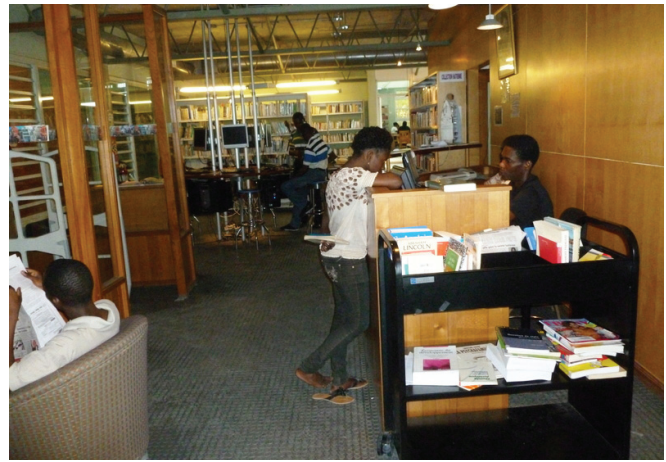
Monique Calixte Library at FOKAL