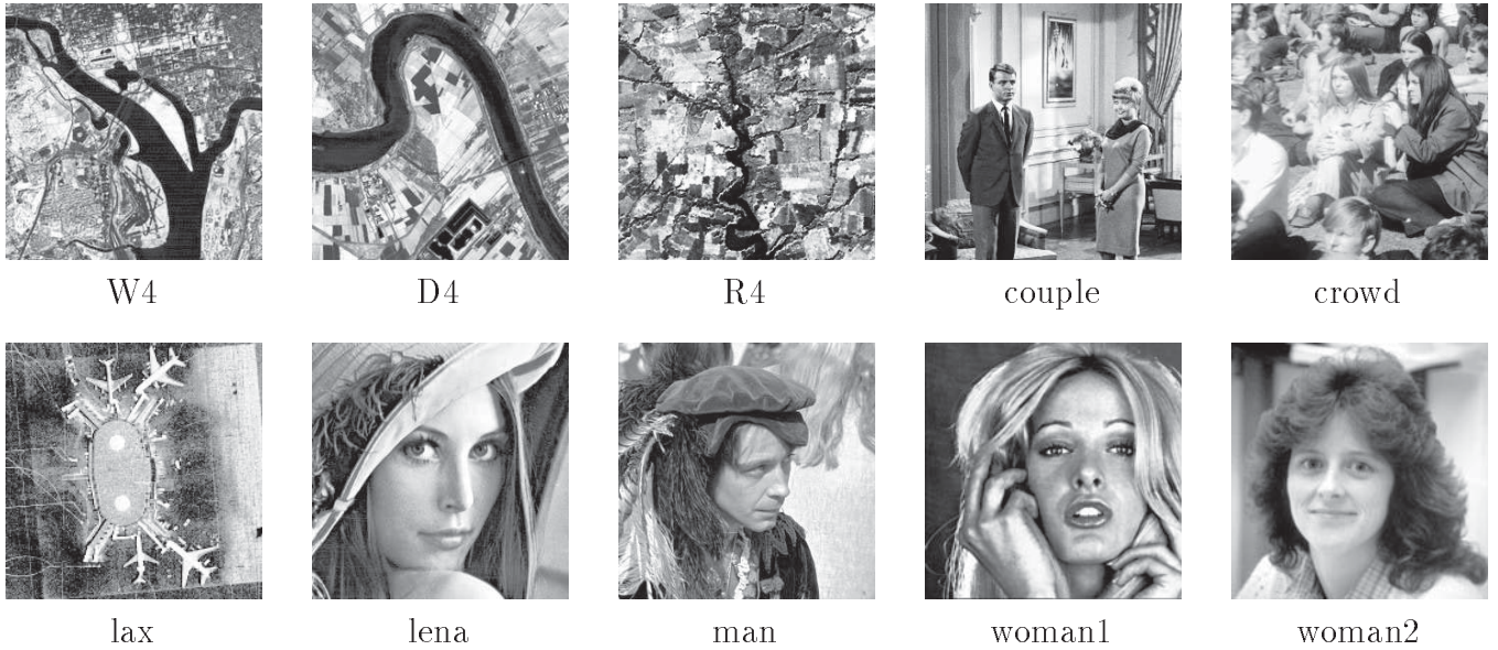
Figure 3: Some of the test images, shown here to identify the images and to give some idea of their characteristics. The first three images are Band 4 of the Washington, Donaldsonville, and Ridgely Landsat Thematic Mapper data sets. The Ridgely images are 468 \times 368 pixels; all others are 512 \times 512 pixels. In this figure all but three images have been cropped to 256 \times 256 pixels. The exceptions are ‘lax’, cropped to 192 \times 192 , and ‘woman1’ and ‘woman2’, left at 512 \times 512 .

We use the following definitions in this section.