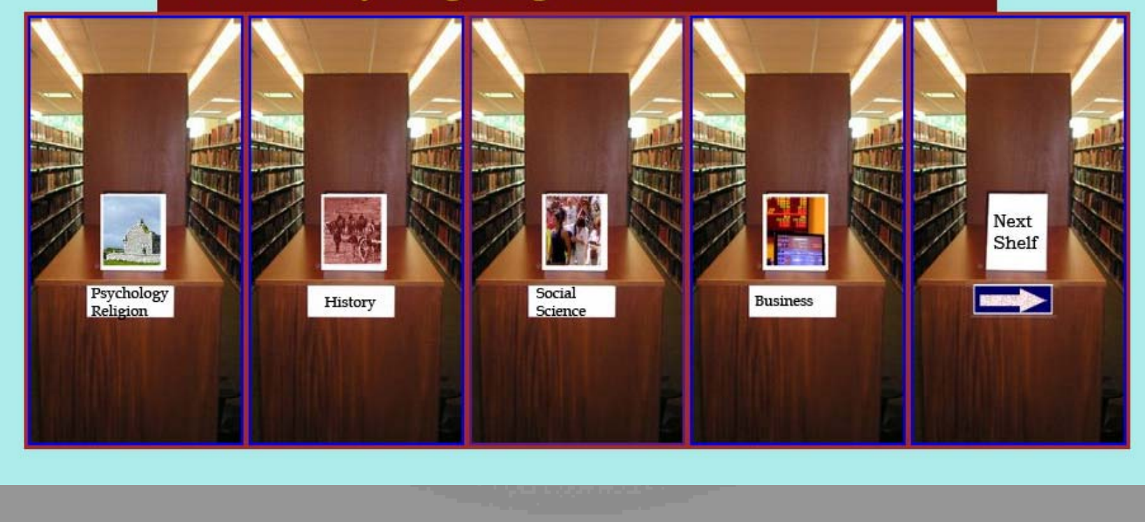
Click on any range to get started

Arnold Bernhard Library Electronic Reference Shelves