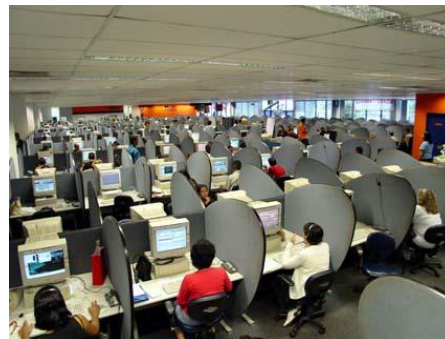
Figure 1: Images from Call Centers ("Call Center," 2010; Call Center in Brazil," 2009)

Call centers typically handle either inbound calls or outbound calls or can handle traffic from both directions. Inbound call centers specialize in handling incoming calls initiated by outside callers calling into a call center. These calls pertain to functions that relate to, but are not limited to—customer service, help desk services, reservations, and sales support. Outbound call centers handle outgoing calls, calls that are initiated from within a call center. These outgoing calls pertain to certain aspects of business such as tele-marketing, survey businesses, and the like (Gans, et al., 2003). Some inbound call centers also initiate