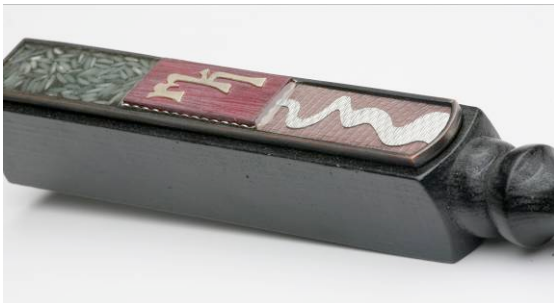
silver, copper, aluminum, purple-heartwood, rice, resin

Steady Stick is a response to my literal and figurative need for support and guidance as I move forward on my life's path.