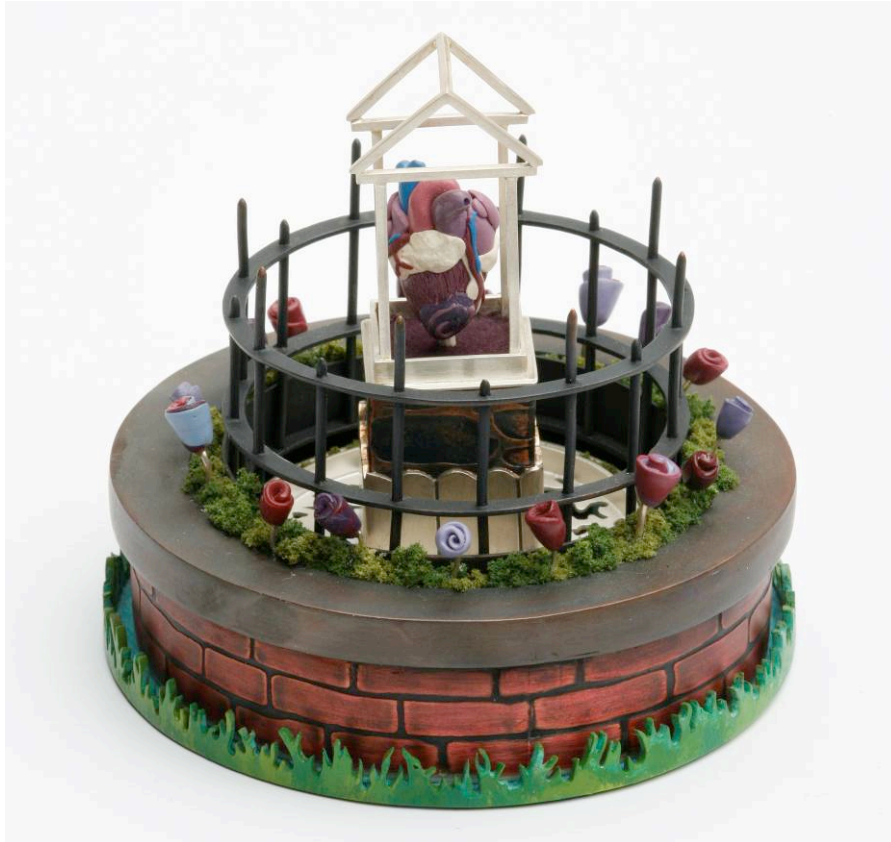
4.5”x 5” stacked silver, copper, faux foliage, Fimo, photo, paper, resin, fabric

The second in my stackable wearable series uses an image of the human heart to reference my innermost feelings – the extravagantly romantic. This tower is a physical manifestation of my sentiments regarding the idea that Home Is Where the Heart Is . My emotions are well protected within four layers of walls and fencing.