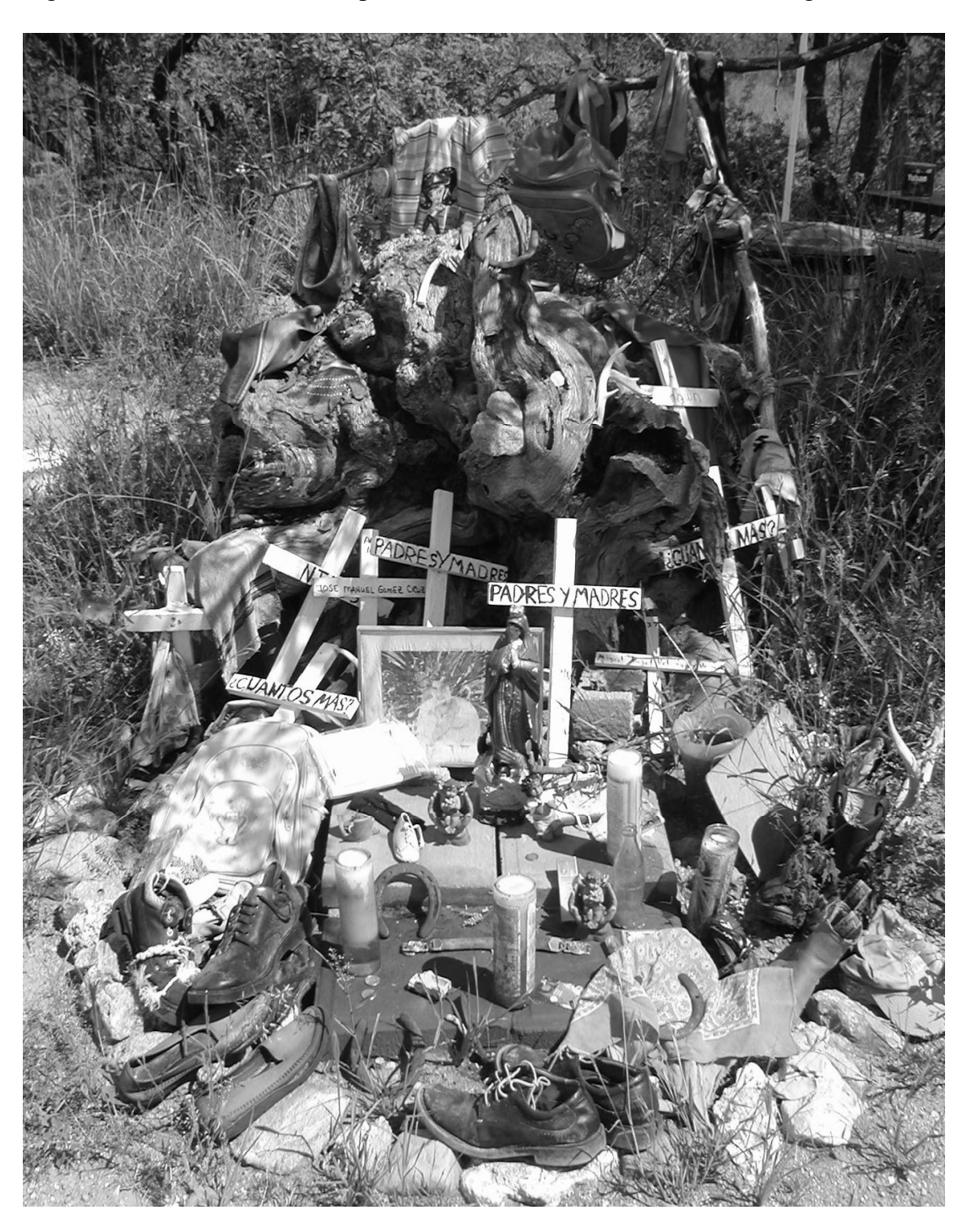
Figure 3: No More Deaths camp shrine.