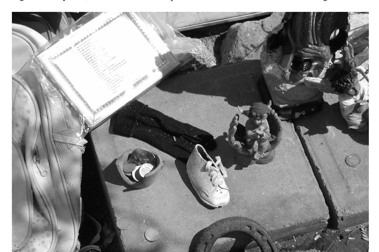
Figure 1: Baby shoe, No More Deaths camp shrine.