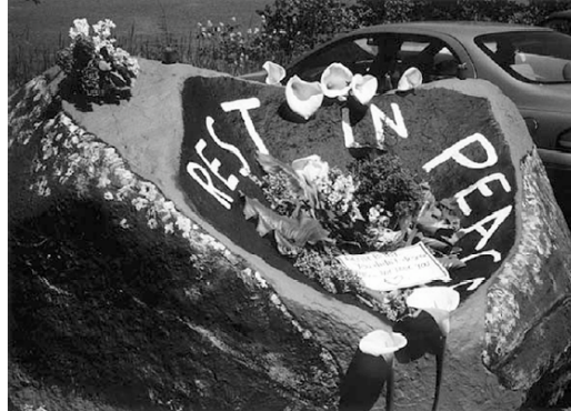
A memorial erected by activists after the successful 1999 Makah Whale Hunt. 196