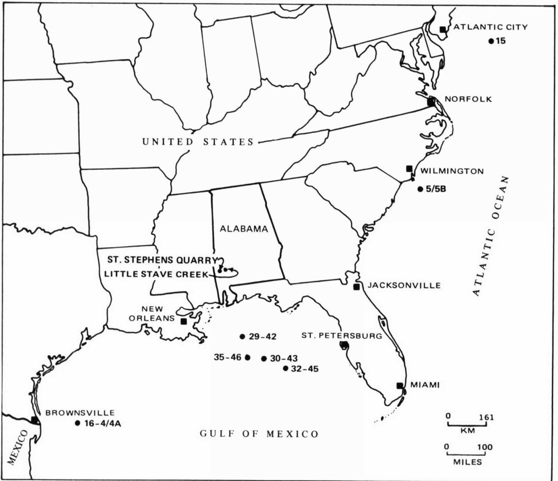
FIG. 1. Distribution of Atlantic slope and northern Gulf of Mexico coreholes and Alabama surface sections; solid circles indicate study localities, solid squares major cities.

Specifically, use was made of the following coreholes; depths indicate feet below sea level.