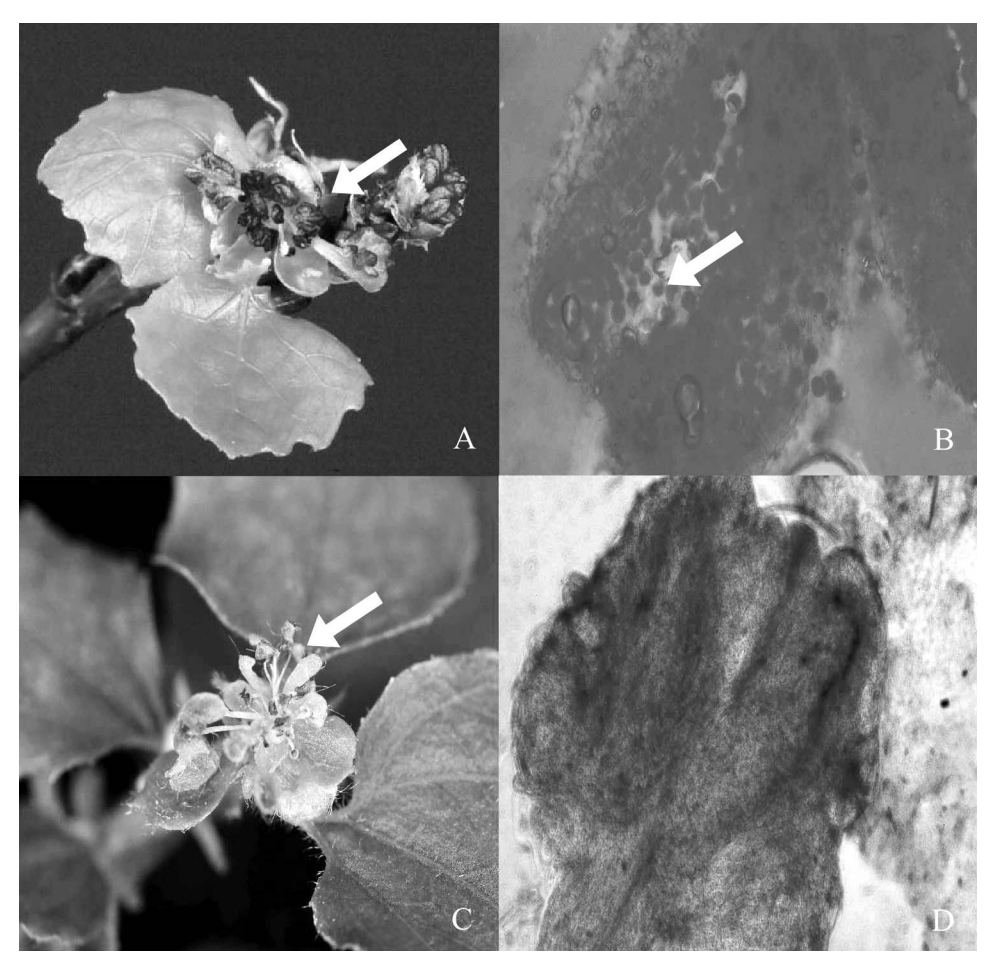
Figure 2. – Early flowering (T58-3) and early flowering-sterile poplar (T98-3). Arrows show flowers or pollen grains contained in anthers.

(A): Early flowering 35S:: Leafy -poplar. (B) Detail of the flower and detail of anther containing pollen grains (stained with acetic orcein), (C): Early flowering-sterile poplar (transformed with 35S:: Leafy and C-GPDHC:: Vst1 , (D): Detail of anther devoid of pollen grains (stained with acetic orcein).