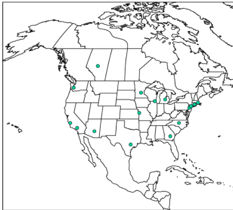
Figure 1 Location of included academic pediatric integrative medicine programs.

vs. 57% of inpatient services. In one case, pediatric referral was required in order to create dialogue with physicians around CAM and to insure that patient load could be accommodated. Physician referral was preferred in the inpatient settings. One service only accepted physician referral because they did not want to be perceived as going behind any physician’s back, while another accepted self-referral if the patient’s insurance accepted it.