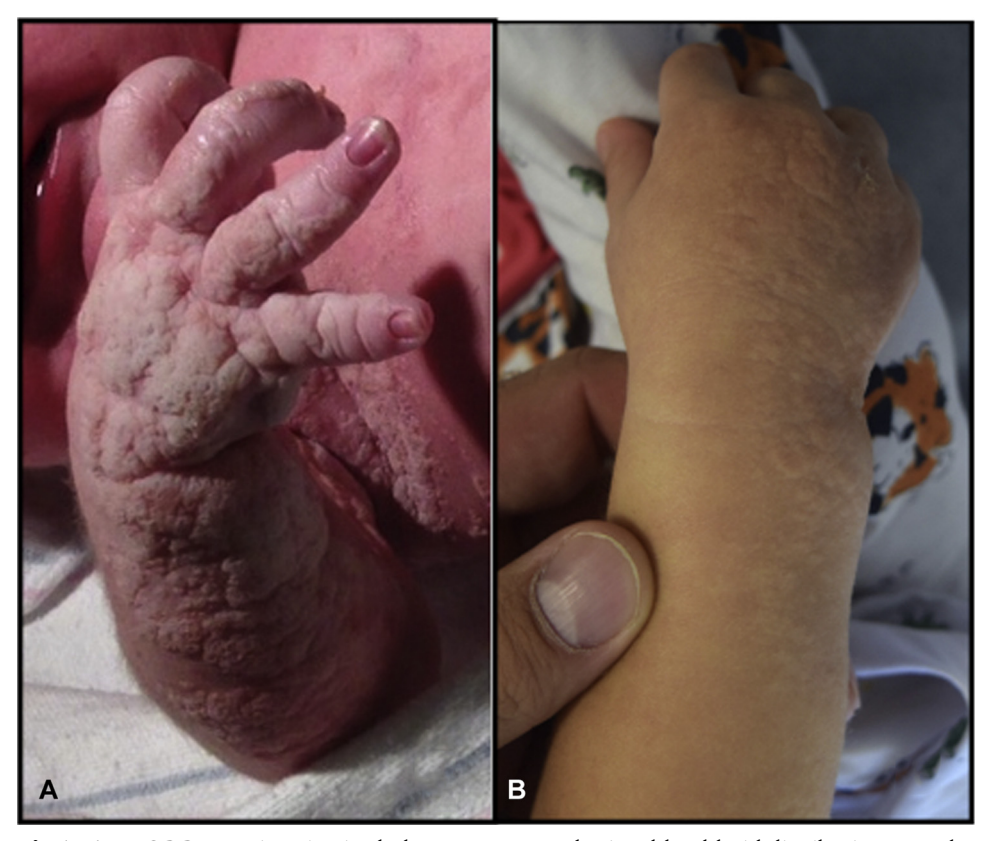
Fig 1. A, PEODDN. Patient 1: stippled verrucous papules in a blaschkoid distribution over the hand and forearm seen at birth. B, Patient 1: Marked decrease in linear papules and plaques seen at 15 months of age.

improvement, with thin, less than 1-mm papules scattered over the right forearm.