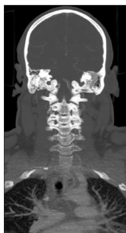
Figure 1: Coronal computerized tomography revealing C2–C3 fusion and obliteration of C3–C4 transverse foramen

Conservative options are available for the treatment of Bow Hunter's syndrome and involve behavioral modifications, restrictive braces, cervical traction, as well as the use of