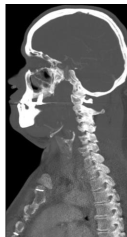
Figure 2: Sagittal computerized tomography revealing C2–C3 fusion and obliteration of C3–C4 transverse foramen