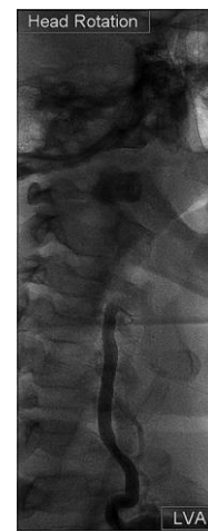
Figure 4: Dynamic fluoroscopy of the left vertebral artery showing obliteration of the left vertebral artery flow with head rotation to the left