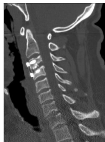
Figure 6: Sagittal computerized tomography after anterior cervical discectomy and fusion at C3–C4

anticoagulant medications. When conservative therapy fails to provide relief, surgical procedures may be utilized. Decompression and fixation are two techniques available for the treatment of Bow Hunter's syndrome. Fixation is directed at removing rotational ability at the affected joint. A 50-70% reduction in head rotation is associated with fusions at the atlantoaxial joint. Subaxial fusions result in minimal reductions in head rotation. Decompressive procedures are effective at stabilizing blood flow while minimizing the reduction in head rotation. [6] Factors such as the surgeon's preference, presence of anterior foraminal stenosis due to uncinate osteophytes, or the presence of posterior foraminal stenosis due to a hypertrophied joint facet should be considered when deciding upon a certain technique. VA anomalies should also be considered prior to surgery. In a prior study, we reported the number of interarterial anomalies to be 10%. We are reporting a case where the patient had a hypoplastic anomaly of the right VA and a dynamically compressible left VA, a presentation that has not previously been described in the literature.