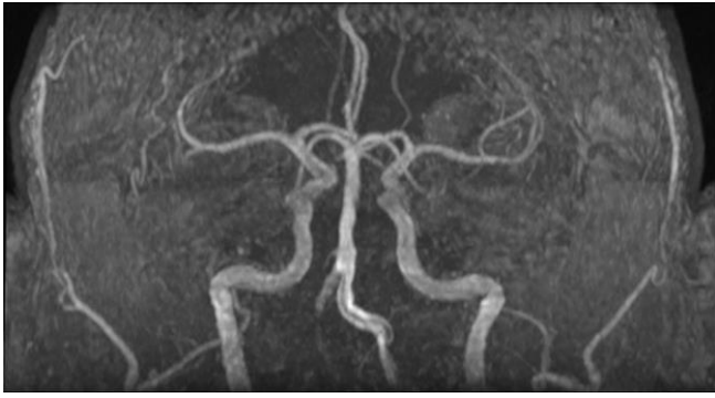
Figure 3: Magnetic resonance imaging of brain showing hypoplastic right vertebral artery