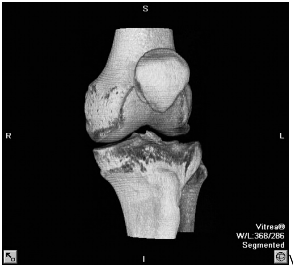
Figure 1. Three-dimensional image of the proximal tibia reconstructed with Vitrea imaging software.

When applying the Vitrea 2 for measuring the volume and area of the proximal tibia, 18 patients were randomly selected from the radiology imaging database at Northwestern Memorial Hospital. With the imaging of the proximal tibia ( Fig 1 ), the software allowed each slice of the CT scan to be viewed. The CT slices ranged from 1.5 to 3 mm. As each cut was visualized ( Fig 2 ), the area desired was highlighted and marked for analysis ( Fig 3 ). This process was performed for multiple cuts of the proximal tibia metaphysis until a simulated complete 3D image of the portion of the tibia to be measured was created. The cortical bone was omitted because only the cancellous bone is of interest for harvesting. The software provided the option for measuring both the volume and area of the 3D highlighted region. A 2D measurement of the maximum height and width of the proximal tibial metaphysis was also made at this point. The maximum height was set at 5 cm to simulate the depth of the curette used, and the width of the tibia was measured at the widest dimension in a medial lateral direction.