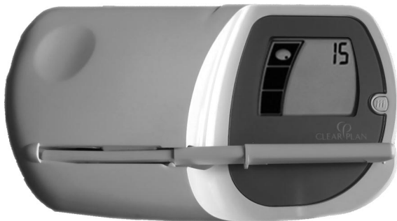
Figure 1. ClearBlue Easy Fertility Monitor with a test stick inserted. Three bars indicate low (1 bar), high (2 bars, based on detection of E3G rise), or peak fertility (3 bars and an egg symbol, based on detection of luteinizing hormone threshold).

women use the monitor to test urinary estrone-3-glucuronide and LH levels from days 6 to 26, creating 20-day “artificial cycles.” If, during a 20-day interval, no LH surge has been detected, the monitor is retriggered to start a new 20-day interval. When an LH surge is finally detected, ovulation will occur within the next few days 22 and menses will ensue within the next few weeks (Figure 2).