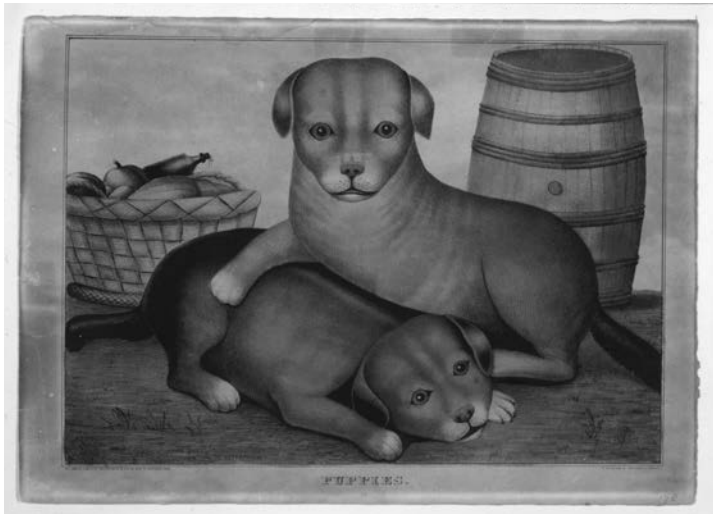
"Puppies." 1848, color lithograph, Library of Congress Prints and Photographs Division, accessed June 20, 2017, http://www.loc.gov/pictures/item/95505016/ . LC-USZC4-3218.