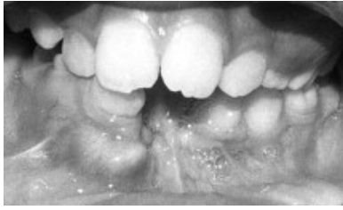
Fig. 4. Free movement of the fragments.

Radiographs confirmed the median cleft of the mandible. The mandibular left cuspid was in an abnormal position (Figs 5, 6).