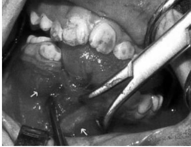
Fig. 8. After debridement, the 2 bone fragments could be observed independently ( arrows ).

Concerning correction of the bony defect, an autogenous iliac crest bone graft of 3 cm was planned. An occlusion as stable and functional as possible for the child's age was selected.