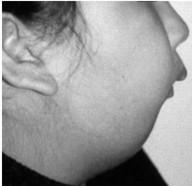
Fig. 2. Lateral view of the patient, showing the lack of chin prominence.

The upper and lower lips were intact, but there was a midline cleft of the mandible, and the 2 halves were freely movable. The morphology and size of the tongue were within normal limits, but the tip was bound with soft tissue overlying the midline (ankyloglossia). The lower incisors were not present at the time of the examination. In addition, there was evidence of other skeletal deformities: larger spaces among the fingers of the hands and the absence of chin prominence clinically and radiologically.