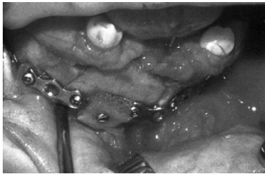
Fig. 9. Iliac crest graft positioned and fixed with plates and screws.

The bony defect was bridged with the autogenous iliac crest bone graft as described earlier. Rigid fixation was performed with 2 plates and 8 screws (Fig 9).