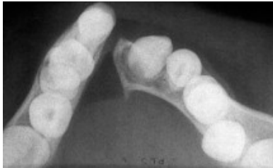
Fig. 6. Mandible occlusal radiograph showing the mandible cleft.

There also was agenesia of the lower incisors.