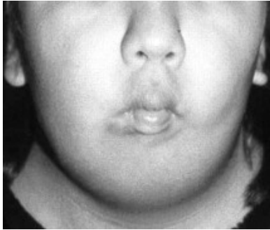
Fig. 1. Frontal view of the patient.

A general clinical examination revealed normal contour of the upper face and head (Figs 1, 2).