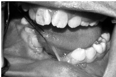
Fig. 7. Ankyloglossia of the patient.

Correction of the soft and hard tissues was performed at the same time. With the patient under general anesthesia, the tongue was released with a Z-plasty, and a frenectomy of the lingual frenulum was performed (Fig 7).